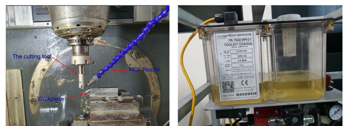
Fig. 1. Experimental set-up.

In this work, the titanium alloy Ti-6Al-4V is selected, and the five-axis milling center DMG DMU50 is used for the machining experiment. The experimental workpiece and machine are shown in Figures 1 and 2. The surface roughness value was measured 3 times at 3 different positions for each experiment by a Mitutoyo Surftest JS-310. The average value is shown in Table IV.