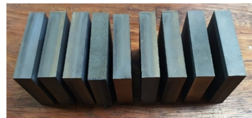
Fig. 2. Workpiece specimen.