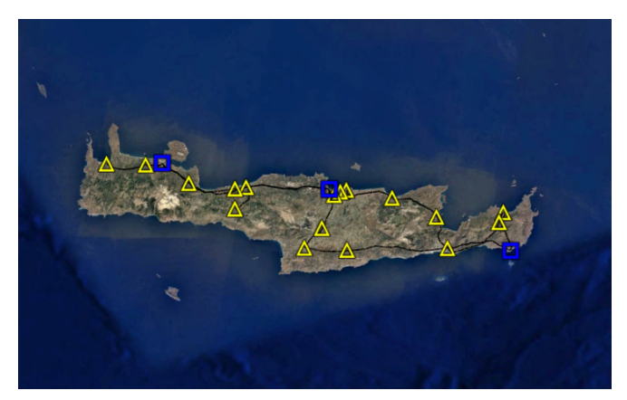
The Transmission System of Crete (screenshot from Google Earth. Fig. 2. Map data: Image LandSat/Copernicus) (yellow triangles: step-down substations, blue squares: step-up substations attached to power plants).

side of the island (eastern of Heraklion) [15-17]. A major program to replace ceramic insulators with composite ones with silicone rubber (SIR) housing has been launched in 2004 in order to cope with the problem, with rather satisfying results [15]. It should be noted however that originally, back in the 80s, a prior attempt to use polytetrafluoroethylene (PTFE) composite insulators proved to be a failure due to brittle fracture issues, attributed to poor design of end fittings [16]. This bad experience held back the further installation of composite insulators for a number of years [16]. The first installation of non PTFE composite insulators started in 1993, in a trial basis. As results were encouraging (no problems reported), large scale installation was initiated in 2004, on the longest line of the eastern side and other lines gradually followed [15]. Today almost all OTLs in Crete have been equipped with SIR composite insulators (with the exception of the far west line connecting Chania and Kasteli that does not face pollution problems and the line connecting Moires and Ierapetra which is under refurbishment). The gradual progress, a necessity derived from operational needs, means that insulators from different generations and manufacturers have been installed in the system. They are collectively referred to as SIR insulators in this paper, even though variation approaches in design and material (e.g. [11, 18]) may exist.