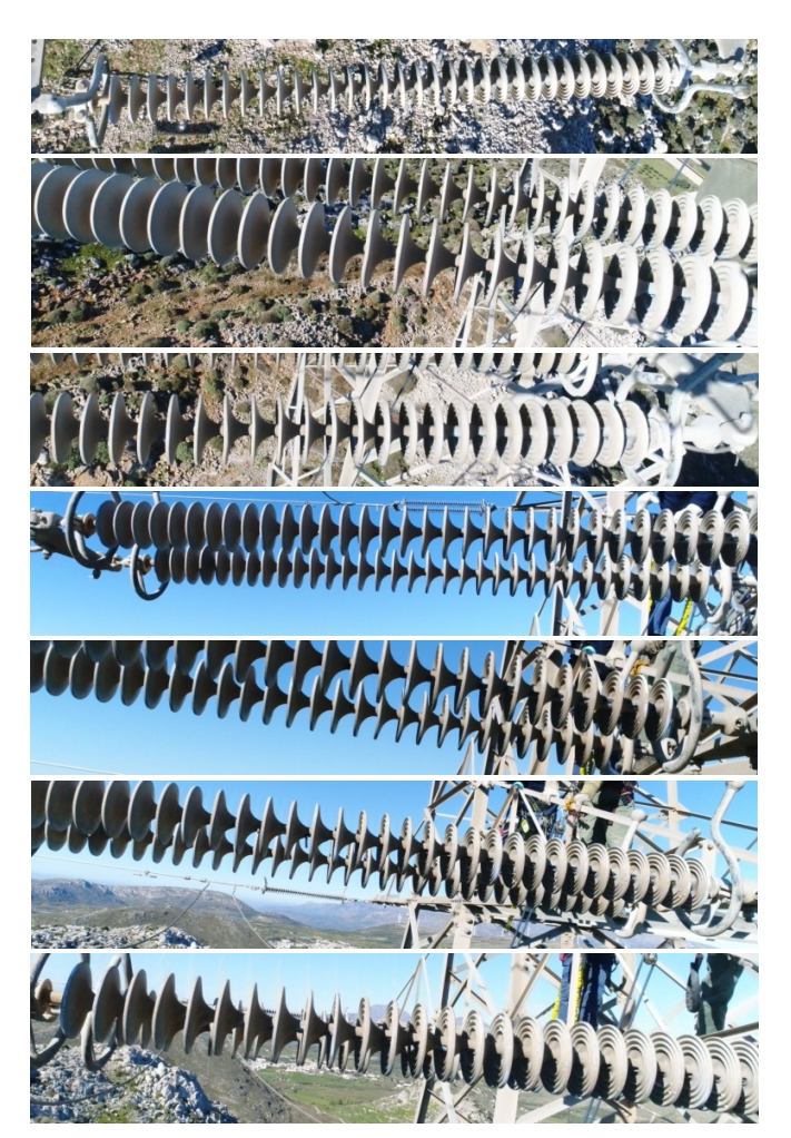
Fig. 10. Views of the flashed under insulator before its removal

The area around Tower 29 is not inhabited. Thus, at the time of the incidents, the information regarding the weather came from the cities of Sitia and Ierapetra (along with inspection information). The location of these cities, next to the substations with the same names, and their relation to the fault location can be seen in Figure 3. The weather information did not seem to advocate for the possibility of a weather related fault. This can be more understood when examining the recordings from the closest automatic weather stations of the National Observatory of Athens network which are located in Sitia and Ierapetra [20]. Their monthly data are easily available through [21] and the rain and wind recordings are depicted in Figure 11. Fault occurrence could not be correlated with any specific weather condition (e.g. strong wind or heavy rain). The first fault was recorded on Feb 16, a day with minor winds that had followed a series of days with much stronger winds. No correlation with rainfall, a factor that may play a role in the flashunder process, could also be established, as faults were recorded on days with no rain in Sitia (Feb 17, Feb 26, Mar 2) or Ierapetra (Feb 16, Mar 2) and Feb 25 was faultless although intense rain fell on both cities.