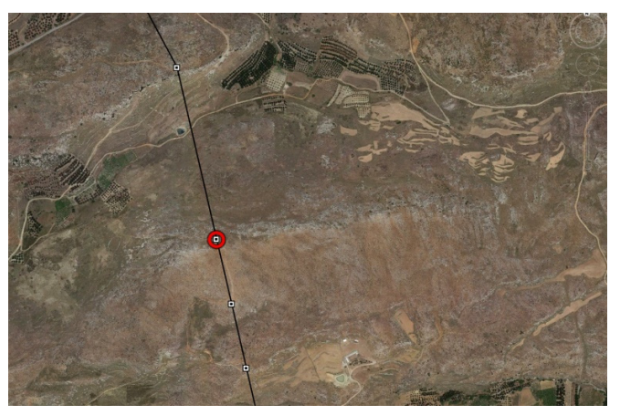
Fig. 7. The location of Tower 29 (red circle) on top of a steep hill (screenshot from Google Earth, Map data: Google Earth)