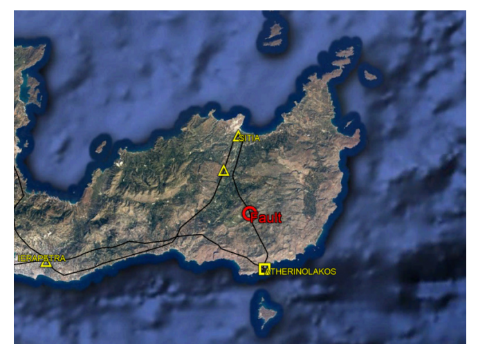
The considered transmission line and the location of the fault at Fig. 3. Tower 29.

The Transmission Line of interest is the one connecting Atherinolakos and Sitia substations at the far east side of the island of Crete as shown in Figure 3. It is a single circuit transmission line, approximately 23.24 km long supported by 67 lattice towers (numbered incrementally from south to north). The installation of SIR composite insulators in this line started in 2006 [15]. A roughly 3 hour drive from Heraklion is needed in order to reach either substation. It should be noted that inspecting thisd line is a tedious task as the line moves over gores and mountainous locations and is subjected to frequent and strong winds. In fact, it is not unusual for the line crew to have to lie down when performing ground inspections in order to be able to maintain a steady view through their binoculars/cameras.