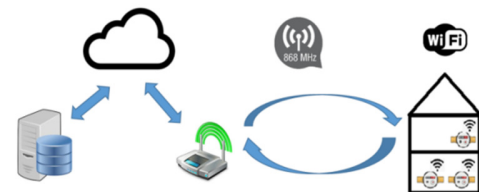
Fig. 1. Block diagram of the system

A Wi-Fi based network is created with 3 Raspberry Pi's [10]. One of them is also used as a hotspot. Another Raspberry Pi is used as a gateway to which the network is connected through RF (radio frequency). RASBIAN (based on Linux) is used on these Raspberry Pi's. For easiness to learn and compatibility reasons, PYTHON language is used. Time periods mentioned below are saved in a file and can be changed by the user. The block diagram is shown in Figure 1 and the flowchart in Figure 2.