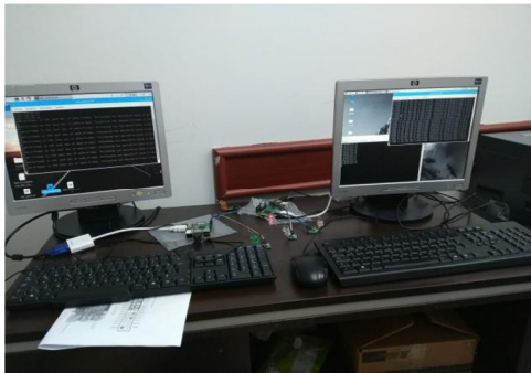
Fig. 4. Debian installed on Raspberry Pi 3 module with RF added

The energy consumption in wireless communication is important. The lifetime of the battery can be calculated according to the equations below [5]: