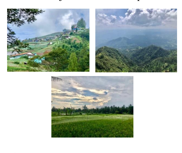
Figure 3 . The Landscape of the Kaliangkrik Region of Magelang Regency which sells Natural and Cultural Landscapes as a Competitive Tourist Attraction as a Community economic revival.

and includes problems which is technical in nature with a multi-disciplinary, multipersonal and multi-dimensional approach so that in the end the quality of the area and the tourist objects in it can be improved.