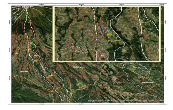
Figure 4. One of the Distributions of Tourist Attractions in Temanggung Village In Butuh Hamlet Temanggung Village.

A quality creative tourism attraction is largely determined by several factors, namely: it is a tourism activity where tourists can develop their creative potential through active participation in the experience of learning art, heritage or the special characteristics of the place visited, Muhamad Muhamad, Saryani (2021). The creative communities in the destination in terms of tourism must be based on the local culture. Art and cultural activities become an important part of this process, so the community will still thrive, when, in time, the tourist leave their tourism destination. "The advantage of this pattern is that the creativity of the community continues to develop, while simultaneously reviving the local people's economy, more importantly, regional tourism will stay alive because they are supported by local creativepreneurs - local people who are creative and have a high entrepreneurial spirit.