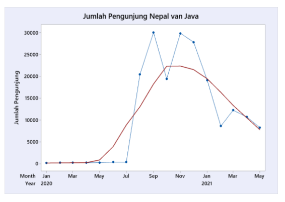
Figure 1 . Rate of Tourist visitors to "Nepal van Java" during the Covid-19 pandemic.

decreased from the previous month, which amounted to 28,520 people. In February 2021, the number of visitors experienced a decrease of more than 40% to 8,814 people and experienced an increase in the next month of 3,731 people, amounting to 12,545 people. Meanwhile, from April to May 2021, the number of visitors keeps decreasing as the Enforcement of Restrictions on Community Activities (PPKM) gets more and more strict.