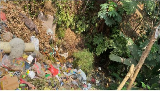
Figure 2. Waste Generations in Sewers, RT 11, Cimande Village