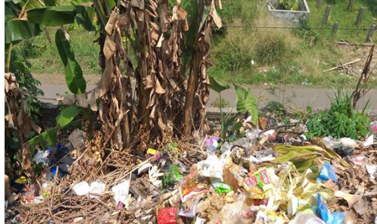
Figure 4. Waste Generation near the grave, RT 08, Cimande Village