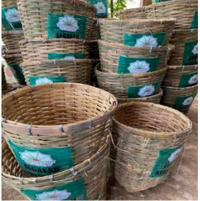
Figure 8. Making Rubbish Baskets by the Community