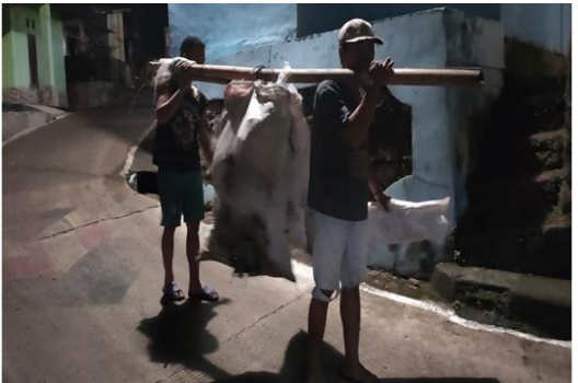
Figure 6. Process Collecting the Rubbish

The behavior of the people who do not care about the environment needs to be changed. This is not easy, because changing behavior is something that cannot be done in a matter of hours or days. The method that can be done is with socialization that is able to touch all levels of society intensively and continuously. In order to optimize Sapta Pesona with waste management in the development of the Tourist Village, Cimande strategies that is carried out, as follow: