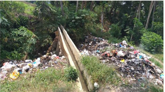
Figure 5. Waste Generation in sewers, RT 08, Cimande Village