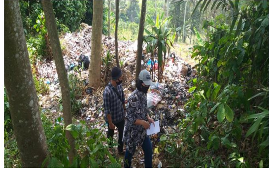
Figure 3. Waste Generation in green area, RT 09, Cimande Village