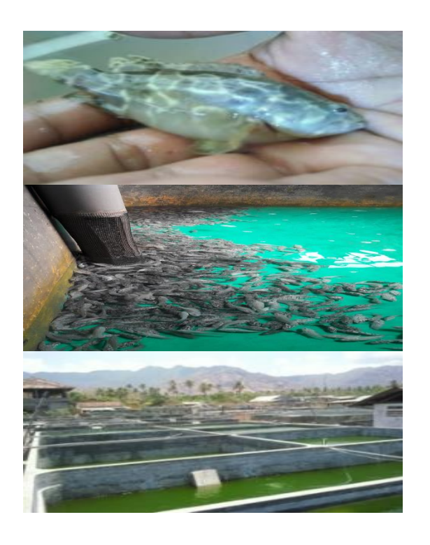
Figure 1. Photograph of Cantang Groupers in the form of seed or juvenile

Environmentally friendly cultivation is applied both to grouper rearing activities in cages and to hatcheries. They use combination of natural food and pellets plus enzymes that enrich feed and vitamins. The farmers use application of biosecurity and integrated controlled marinculture. Post-harvest ability: groupers are sent in a fresh condition of life using a plastic bag that is given enough oxygen and the fishes are fasted before being packaged. The delivery of grouper size consumption uses aquarium that is transported to the Hong Kong ship berth. The grouper quality test includes: physical quality test, chemical and biological pollutant content, as well as fish taste test, unique taste and flavor elasticity. Human recources development conducted by government, private sector, NGOs and experienced farmers.