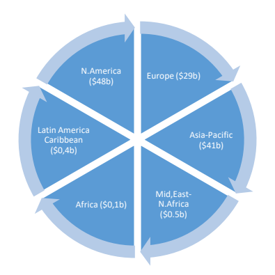
Figure 1. Life style wellness

Wellness Economy, predicts that by 2015, a wellness lifestyle will reach a market of around $ 118.8 trillion which will concentrate on North America, Asia and Europe, more details can be seen below.