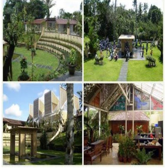
Picture 6. Ubud Botanic Garden

Ubud Botanic Garden was established by a German expatriate, Stefan Reisner, and his Indonesian wife. The site, located in Central Bali at Kutuh Kaja village near the renowned art center of Ubud, on the banks of a river gorge, is held on a 30-year lease from the local village. It has a botanical collection of local and exotic species and a range of Theme Gardens: a great fountain, a fern garden, a chocolate garden, a heliconia grove hill, fragrant floors, a meditation court, a bamboo grove, a water lily pond, a rain forest observation post, a bromeliad garden and an alang-alang trail picture