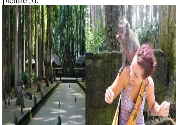
Picture 5. Sangeh Monkey Forest

temple, Pura Bukit Sari, found at the heart of the forest. The monkeys of the forest are believed to be sacred and will approach anyone paying respects at the temple (see picture 5).