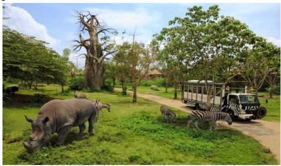
Picture 1. Bali Safari and Marine Park

Bali Safari and Marine Park in Gianyar (Southeast Bali), as part of the Taman Safari Indonesia and a member of WAZA (The World Associations of Zoo and Aquariums), SEAZA (The South East Asians Zoo Associations), CBSG (Conservations Breeding Specialist Group) and PKBSI (Indonesian Zoological Parks Associations), is at the frontline of wildlife conservation in Indonesia and is actively involved in ensuring the future survival and well-being of many Indonesian animal species through education programs conservation such the conservation and release of Bali Mynah, Sumatran Elephant, and Sumatran Tiger (see picture 1).