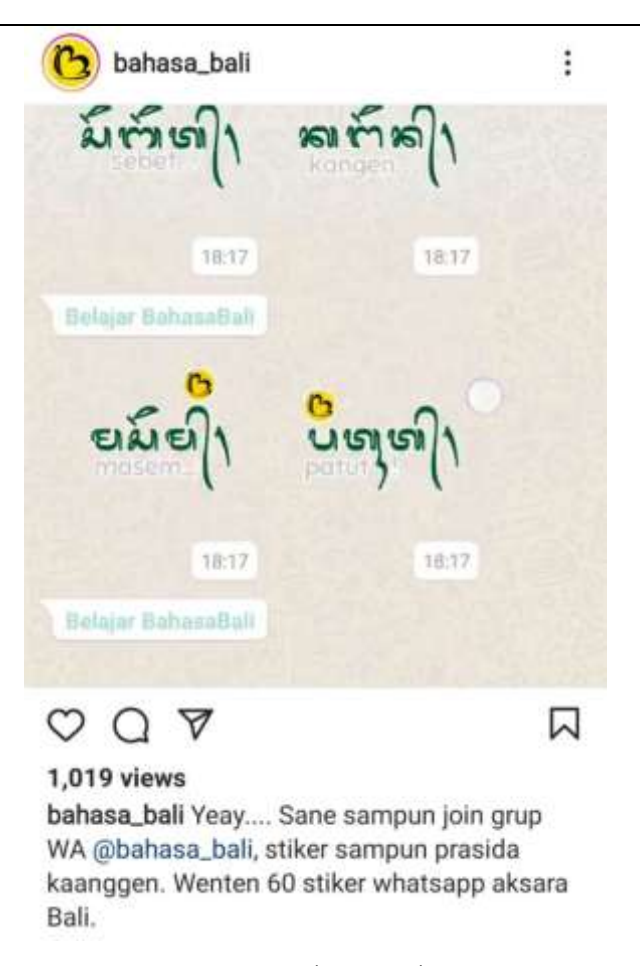
Figure 4. Data 4

On the fourth data, the Instagram caption for the @bahasa_bali account is "Yeay...Sane sampun join group WA @bahasa_bali, stiker sampun prasida kaanggen. Wenten 60 stiker whatsapp aksara Bali". This caption contain code switching dan code mixing, form of code switching are "yeay", "stiker whatsapp" and "whatsapp" and form of code mixing is "join group WA". The words "yeay", "stiker whatsapp" and "whatsapp" on the caption because there are no words in Balinese that can be used to represent the word "yeay", "stiker whatsapp" and "whatsapp". The "yeay" is represent to yes used in certain circumstances to express happiness. The words "stiker whatsapp" and "whatsapp", used as a representation of the communication platform and the WhatsApp sticker is one of the features in the WhatsApp application in the form of images and messages. The speech act of mixed code "yeay", "whatsapp sticker", "whatsapp" is a speech act (locutionary) statement. Statement is an assertive function. These word are used in the context (communication) between content creators and followers of the @bahasa_bali account who both master the language, by involving speech participants who