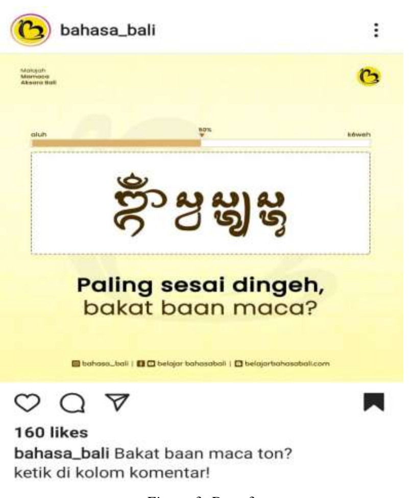
Figure 3. Data 3

Code mixing found on third data, the caption is "Bakat ban maca ton? ketik di kolom komentar!". Phrase "ketik di kolom komentar" is a phrase in Bahasa, this is because speakers or admins from @bahasa_bali and followers of the @bahasa_bali account or speech partners both master Bahasa. "ketik di kolom Komentar" is a speech act (illocutionary) directing. Directing is a directive function, the admin directs followers to answer the answer if they can read the Balinese script contained in the photo upload. This phrase is used in context (communication) with fellow Instagram users who master the Indonesian language, by involving speech participants who come from the same community, through speech channels in written form.