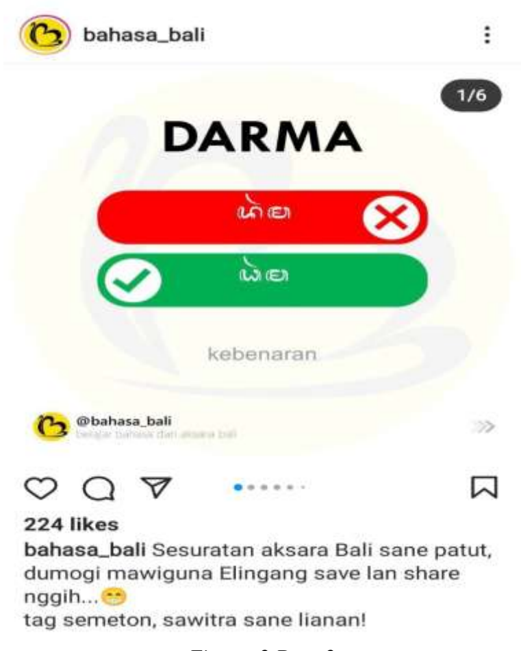
Figure. 2 Data 2

Caption on second data is form of code switching "Sesuratan aksara Bali sane patut, dumogi mawiguna elingan save lan share ngih...tag semeton, sawitara sane lianan" The form of code switching in the caption is the use of words "save", "share" and "tag". The word "save" refers to how to save, the word "share" refers to how to share content that has been uploaded and "tag" is a way to mark content. That used because in Balinese there is no special word that is equivalent for words "save", "share" and "tag". The speech act of code switching "save", "share" and "tag" is a speech act (illocutionary) requesting. Requesting is a directive function, where the admin of the @bahasa_bali account asks his followers to save the content he uploads, share and tag it with other Instagram users.