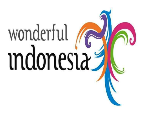
Figure 1. a figure logo of WI

The Wonderful Indonesia logo is an advertisement in promoting Indonesian tourism For in country level, this logo is often found on public transportation such as on the body of the buses, trains, airplanes and public boards so that it can be seen by many people. Meanwhile in other countries, as a promotional strategy for Indonesian tourism, this logo together with display images or videos of Indonesian tourism objects are installed on the railways, buses and billboards, digital screens, in crowded public places, such as stations, highways, airports and others.