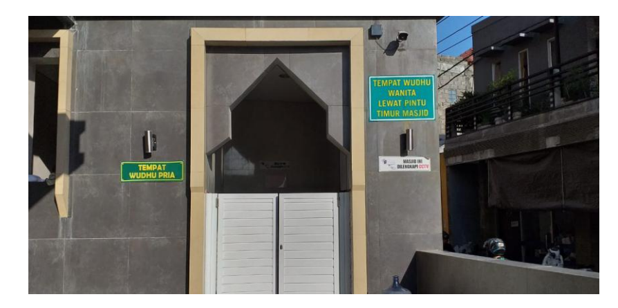
Figure 5 - Male ablution place on the left before entering the mosque