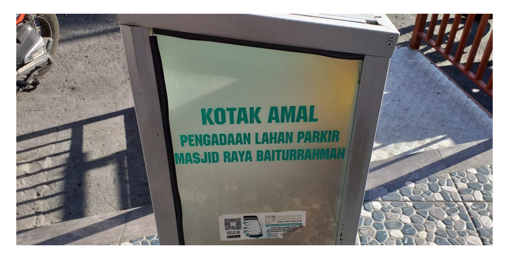
Figure 6 - The writing on the charity box

Charity box is usually completely locked and only opens to collect the money from donors. Functionally, the writing aims to persuade everyone to donate for the mosque's parking area establishment. Baiturrahmah mosque is located next to the main road and has no parking lot for visitors' vehicles. Symbolically, the writing represents visitor's sincerity for donating to help the mosque's development.