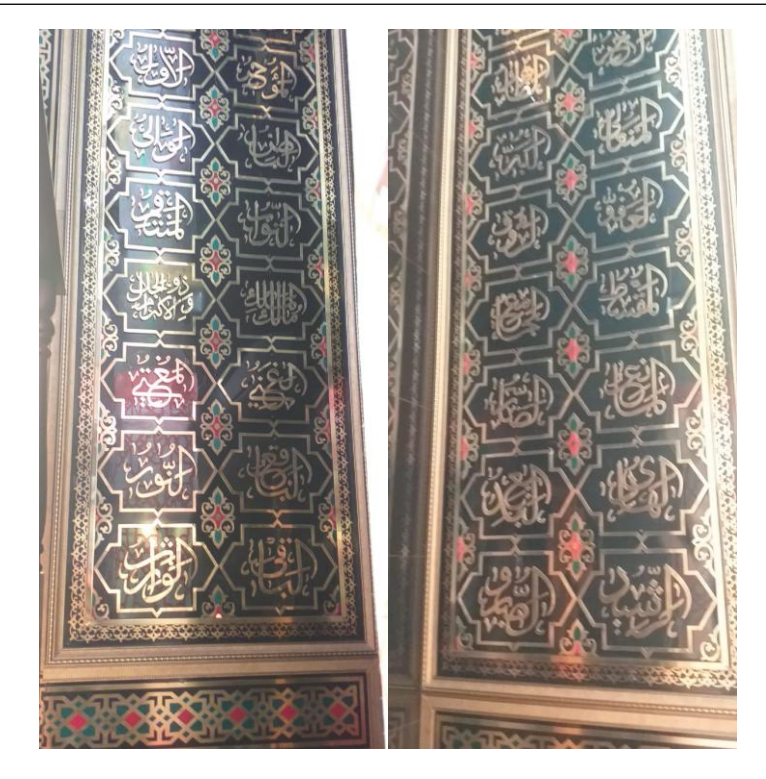
Figure 4 - Asma'ul Husna's writing in the mosque

(Arabic: الأسماء الحسنى, translate. al-asmā' al-ḥusnā) is the etymology of Asma'ul Husna that means magnificent names (Al-Buthoni, 2011). It has been written in Al-Quran, "And the Most Beautiful Names belong to Allah, therefore call upon Him by them (with His attributes)! Leave who distort (the meanings of) the Names of Allah. They will be required for what they have been doing." (QS Al-A'raaf:180).