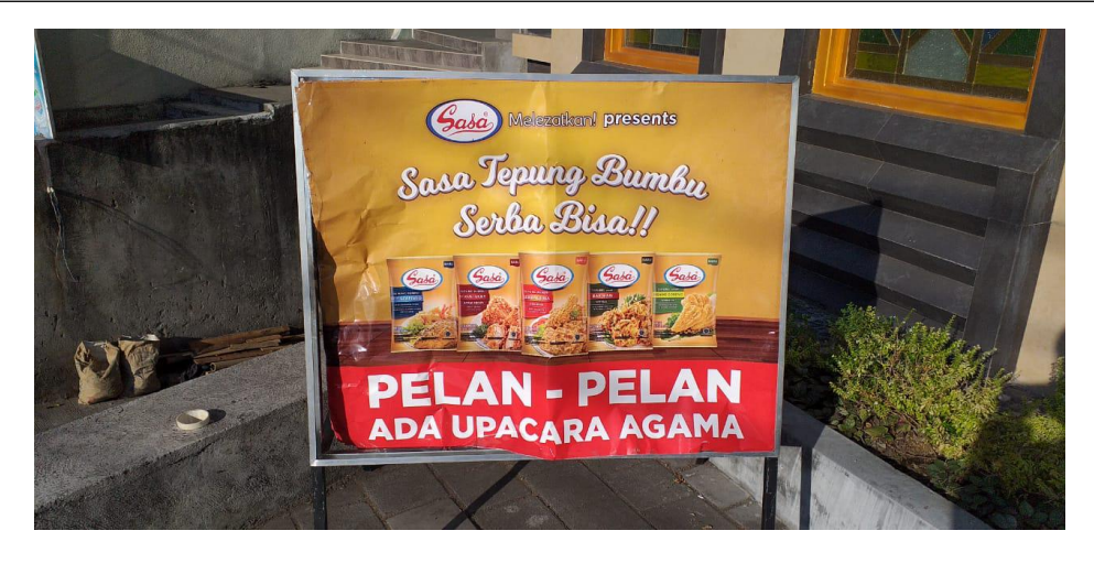
Figure 7 - Signs of notice if there is worship

This type of banner is usually deployed near the mosque in some religious events. The banner is quite modest, even its writing does not represent any exaggeration announcement. Mostly, it informs if there is a religious event conducted nearby.