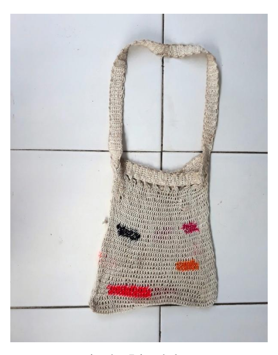
Mesin in the Iriresh language