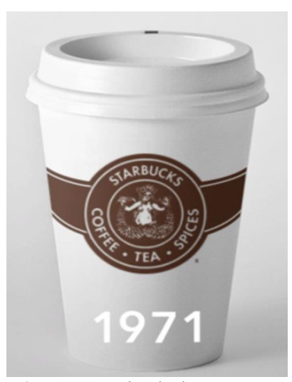
Figure 2. Strabucks logo in 1971

Available online at https://jurnal.iainponorogo.ac.id/index.php/eltall