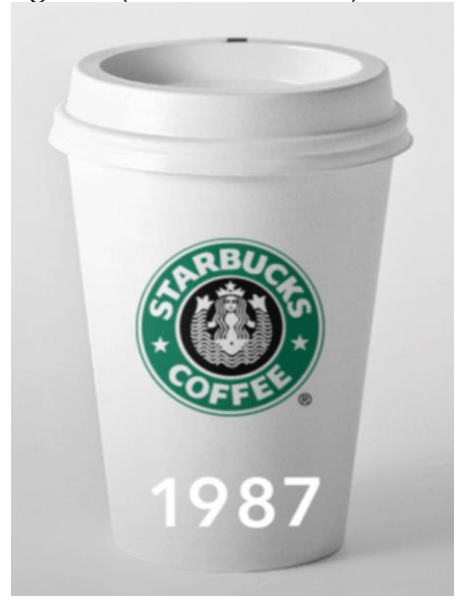
Figure 3. Strabucks logo in 1987

In 1971, the founders chose the name Starbucks after being inspired by Moby Dick. Next up: logo creation. During a search through some old marine literature, something stood out. A siren-like, strange maritime figure called to them. Steve stated, "They adored the design and believed it reflected what Starbucks stood for." "Therefore, we drew inspiration from that and designed the logo accordingly. Moreover, she turned into the siren." There are two significant ties between Starbucks and the maritime community. Seattle, our hometown, is a port city. Due to their proximity to Puget Sound, they feel a profound connection to the water. 2) Coffee frequently travels large distances over water to reach them. Even today, large container ships transport the cargo to the port. They have redesigned their siren several times throughout time. Steve said, "We saw a lot of her in the beginning." The menu was first updated in 1987 when handcrafted espresso beverages were added. At that time, the logo went from brown to green (Flandreau, 2020) that can be seen in Figure (3).