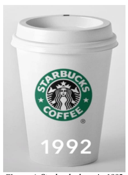
Figure 4. Strabucks logo in 1992

The following logo changes can be seen below (Figure 4).