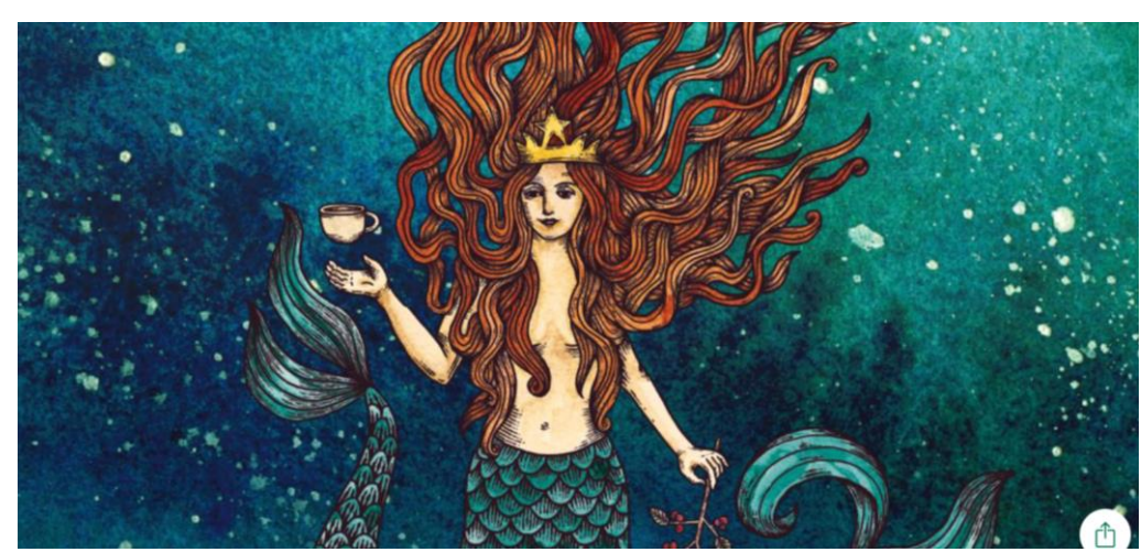
Figure 1. A siren image

Available online at https://jurnal.iainponorogo.ac.id/index.php/eltall