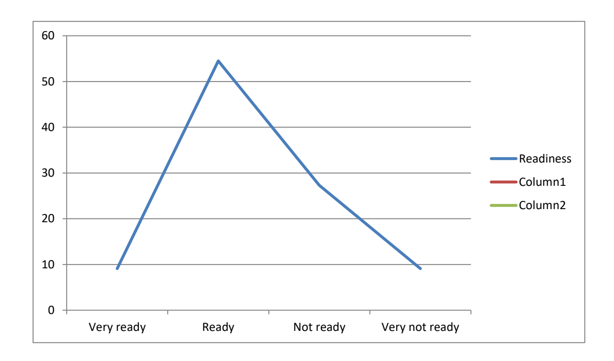
Chart 2.0: Teachers readiness

Available online at https://jurnal.iainponorogo.ac.id/index.php/eltall