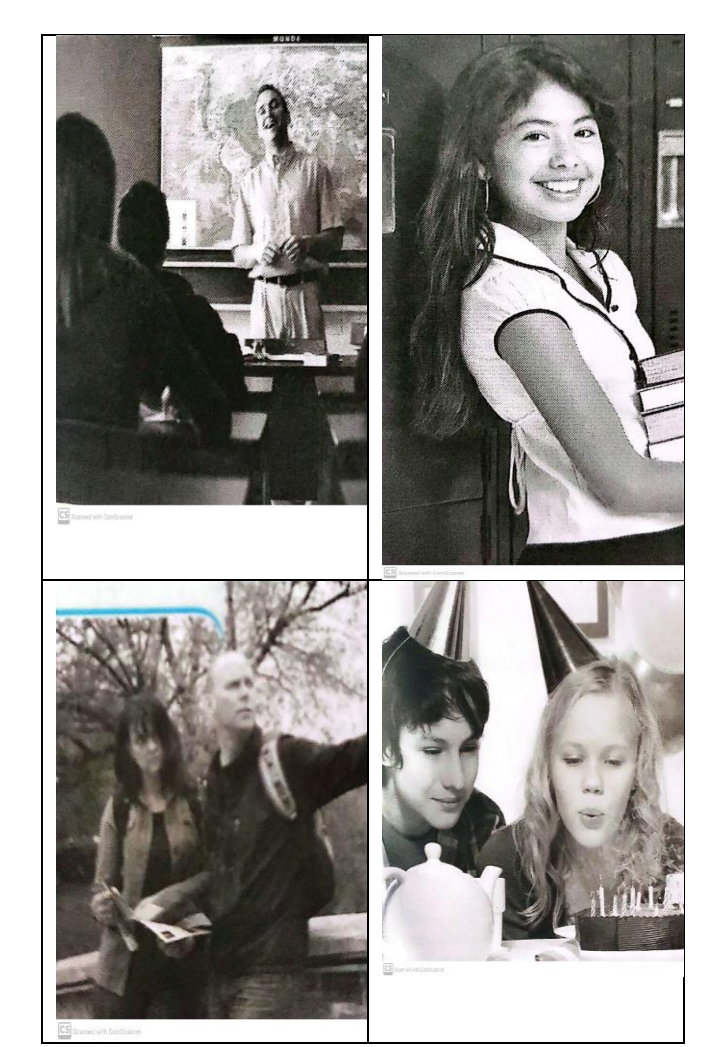
Figure 2. Female and Male Pictorial Representation

The picture presented by "Bright: An English" showed an outnumber of the females by 64 times occurred compared with males by 50 times. The trend showed the same flow of more females than more males, but not in the gap between them. The gap is not very noticeable as only four counted pictures of the book. Although the equal picture like the equivalent number of females and males are more likely to the number of males or females with more than a half times the female's pictorial representation. Overall, as the table indicated, the dominance of females with 33% of the picture represented, followed by males with a gap of 26%. The image which displays an equal share between females and males is 22%. In addition, the rest picture in which more females with 10% and 8% pictures used more males.