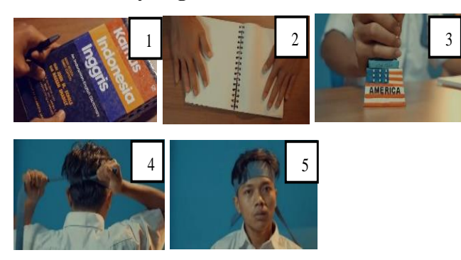
Figure 4. The Senior High School Student Was Preparing to Study English (Pahamy, 2021)