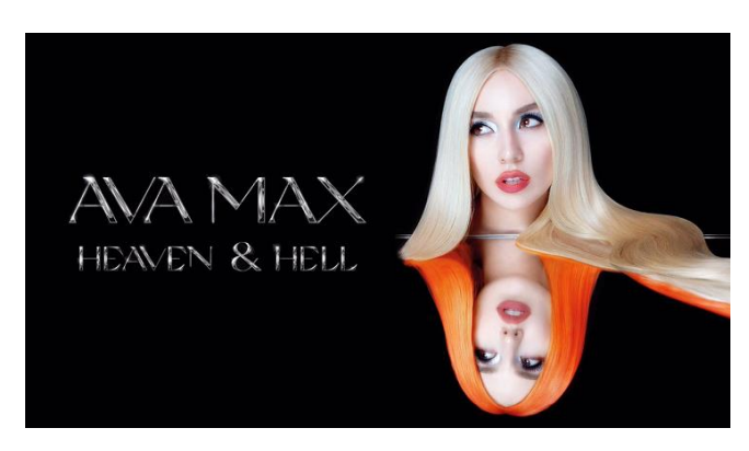
Figure 1. Cover of Ava Max's Heaven & Hell album

Overall, current linguistic exploration of songs is dominantly about identifying figurative language, slangs and word formation processes. Considering the prolific nature of studies on slangs in songs, especially on the word formation processes, further replication might not be able to offer anything new. However, this study still finds value in conducting this study. Upon observing the wide range of data, namely the many different songs that have been studied, this study noted that previous findings were born from small numbers of slang data, ranging from roughly 50 to 150 examples. This study would like to replicate the study of slangs in songs by extending the sample data beyond 200.