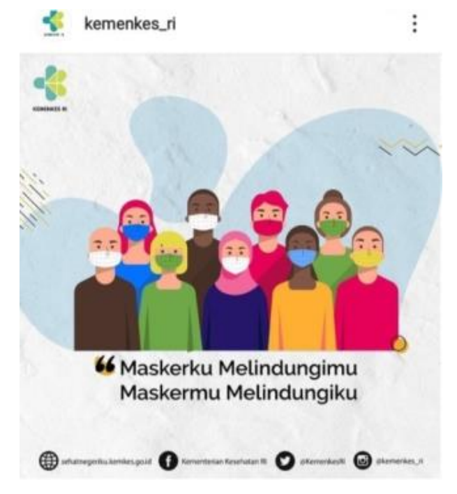
Figure 1 . A Public Service Announcement on the Instagram Account of a Government Organization in Indonesia

seeking, Wang et al. (2020) observed how Facebook users cope with Covid-19 in relation to information sources. In the political side, majority of studies explored government responses to Covid-19 in a national and international scale (Greer et al., 2020; Hale et al., 2020; Haug et al., 2020). The studies cover a very wide range of responses in order to understand, inform and rate the effectiveness of government's responses. This study takes on a more specific route by examining a particular type of government response, namely the government's response to Covid-19 pandemic by educating their people using public service announcements.