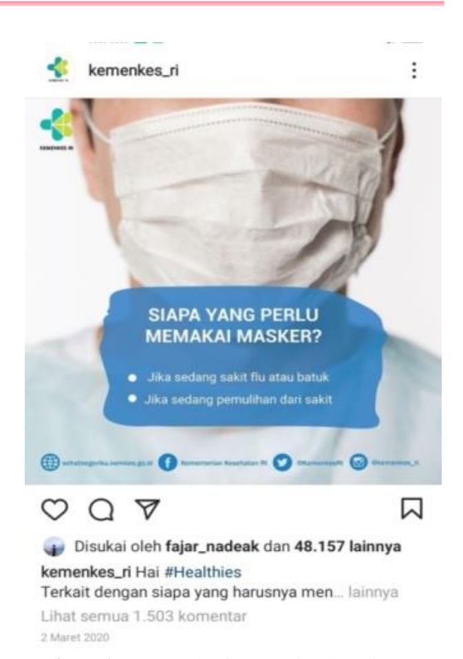
Figure 6 . An example of Conventional Implicature

Last but not least, this study identified two out of eleven Covid-19 PSAs published by the Kemenkes-RI contained a different type of implicature, known as conventional implicature. Where conversational implicatures require people to know the context, conventional implicature is independent of context and non-truth conditional inferences. This is illustrated in Figure 6 .