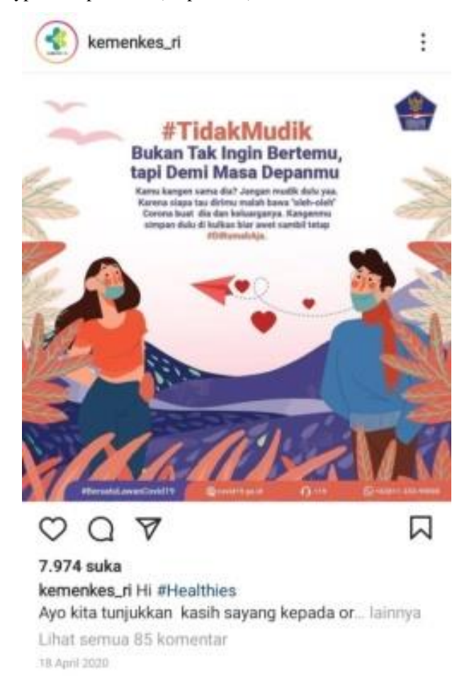
Figure 5 . An example of Particularised Conversational Implicature

The other sub-type of conversational implicature is particularised conversational implicature. Opposite to the first sub-type, this type does require the reader or interpreter to have a particular background knowledge to understand the implied meaning. Only two out of eleven PSAs published from March 2020 to January 2021 were found to contain this type of implicature (18 per cent).