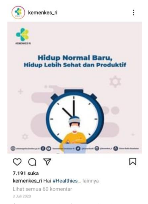
Figure 3 . First example of Generalised Conversational Implicature

Compared to conventional implicature, this study found that conversational implicature is more commonly used by the government to convey information about Covid-19 to the public. According to Grice (1975), this type of implicature has two sub-types, namely generalised conversational implicature and particularised conversational implicature. The former depends on the context and does not require audience or viewers to have any particular background knowledge to understand the implied meaning. This type is found to be the most dominant—seven out of eleven PSAs (64 per cent). The researchers postulated that it is due to the fact that the knowledge of Covid-19 is now a very common information among the public as Indonesia has been living with Covid for more than ten months to date. This means that most people can understand what is implied in the PSAs generally.