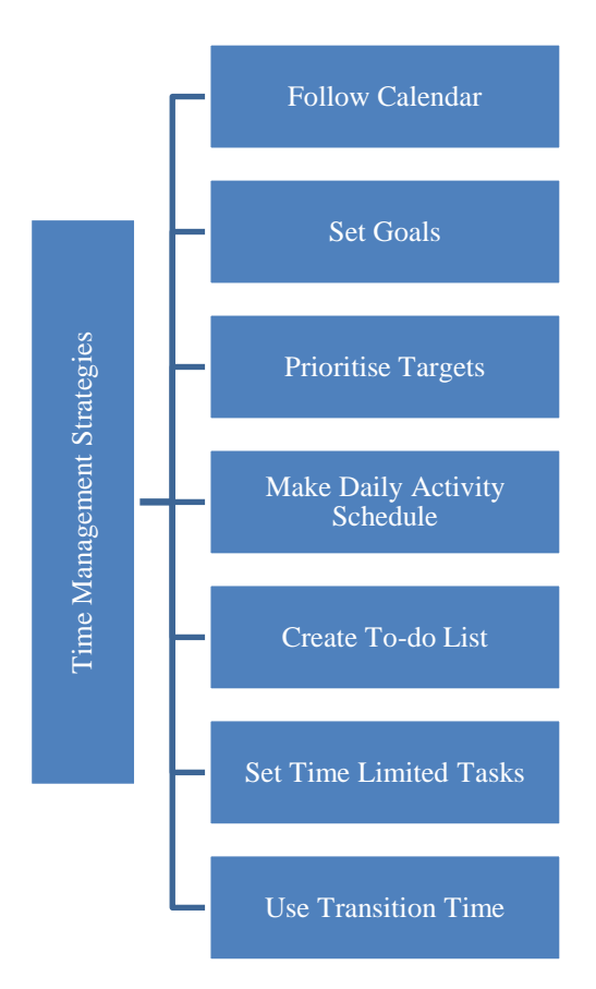
Figure 2. Seven Time Management Strategies

The research findings offered an insight into how English teachers adapted to the change of their class durations and demands caused by the change in the curriculum. The researcher found that seven strategies that the teacher used following the school calendar, settings goals and working on achieving those goals, prioritize the more important goals, making a daily schedule of classroom activities, making a to-do list, setting a time limit for the task in the classroom and utilising transition time effectively.