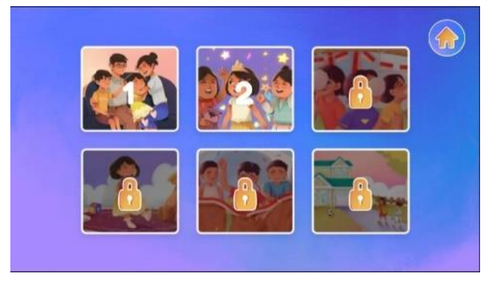
Figure 3. Theme page

The opening page on this Expose application as the initial display to start with the 'start' button then continued with the theme menu.