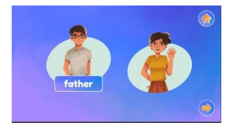
Figure 6. Vocab display

The story menu features an illustrated story equipped with audio. The purpose of the story is to introduce vocabulary in the form of sentences so that children know the concept of words.