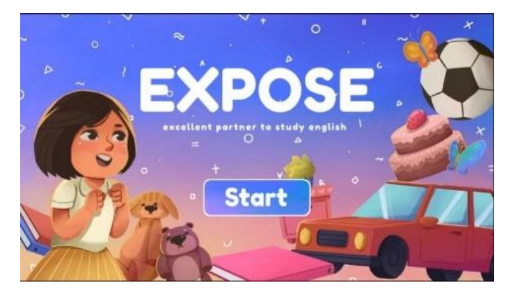
Figure 2. Opening page

the scope of English. This step is the stage of producing predetermined application. The following are examples of activities offered by 'expose'.