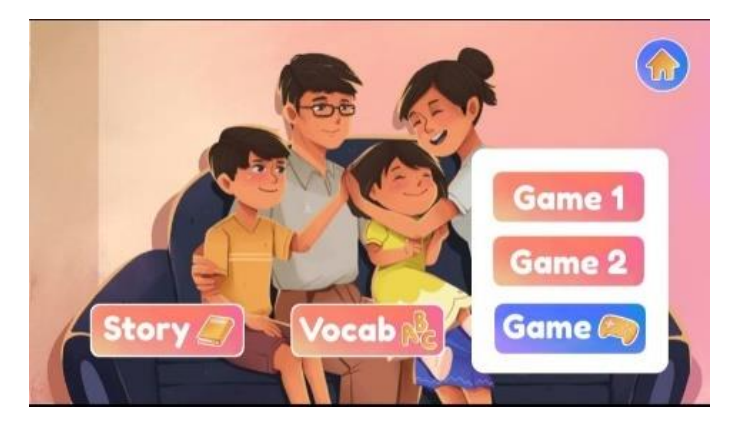
Figure 4. Menu page

This theme page consists of several themes that can be chosen by the child. The purpose of this theme page is variations so that children do not get bored with a theme. The given theme has an equivalent level of difficulty and is not tiered. This is in accordance with the original purpose, namely as a medium for introducing English vocabulary, so that all vocabulary selected in the theme is an easy vocabulary and close to the child. In one theme there will be stories, vocabs, and games.