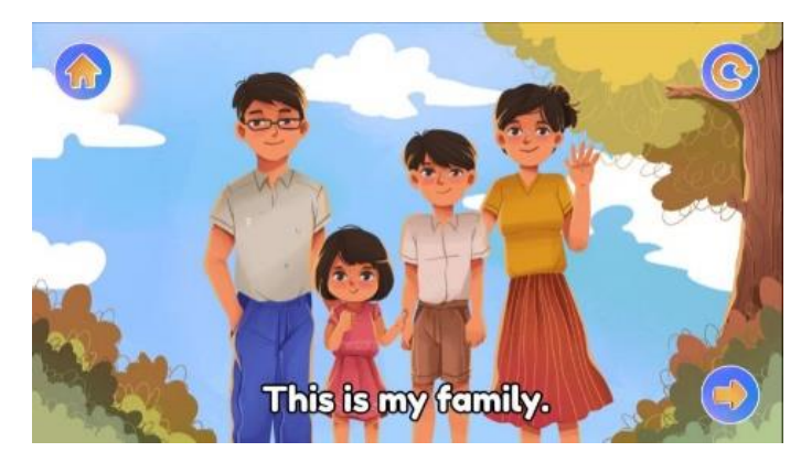
Figure 5. Story display

This menu page displays a selection of activities contained in one theme, namely story, vocab, games.