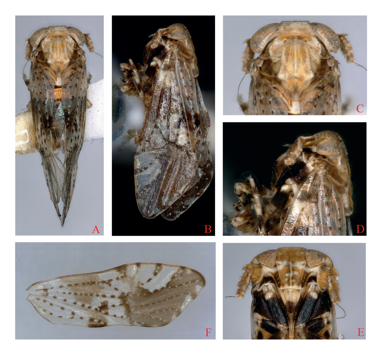
Fig. 1. Neobelocera biprocessa sp. nov., holotype (GUGC-FS-TN-20090401) A . Male habitus, dorsal view. B . Same, lateral view. C . Head and thorax, dorsal view. D . Same, lateral view. E . Face. F . Forewing.

The salient features of the new species include the following: from with pale transverse band below level of lower margin of eyes (Fig. 2B); antennal segment I subsagittate, markedly flattened, with median longitudinal carina, the ventral apical angle longer than dorsal apical angle (Fig. 2B); ventral margin