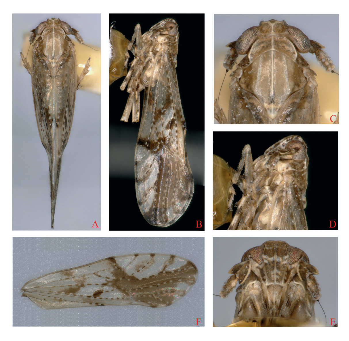
Fig. 3. Neobelocera russa sp. nov., holotype (GUGC-FS-TN-20100801). A. Male habitus, dorsal view. B. Same, lateral view. C. Head and thorax, dorsal view. D. Same, lateral view. E. Face. F. Forewing.

MALE GENITALIA. Anal segment small, ring-like (Fig. 4D). Pygofer in profile much longer ventrally than dorsally (Fig. 4E), in posterior view with opening longer than wide, ventral margin with three medioventral processes, median one longer than lateral ones, truncate apically, lateral ones stout, tapering (Fig. 4D). Aedeagus (Fig. 4F–G) with phallobase, phallus tubular, bent ventrad medially, with node at apex, middle dorsal with a spinous process, directed dorsad, apex with 2 long spinous processes. In addition, 2 processes at subapical part of phallus, right one strongly curved. Phallobase