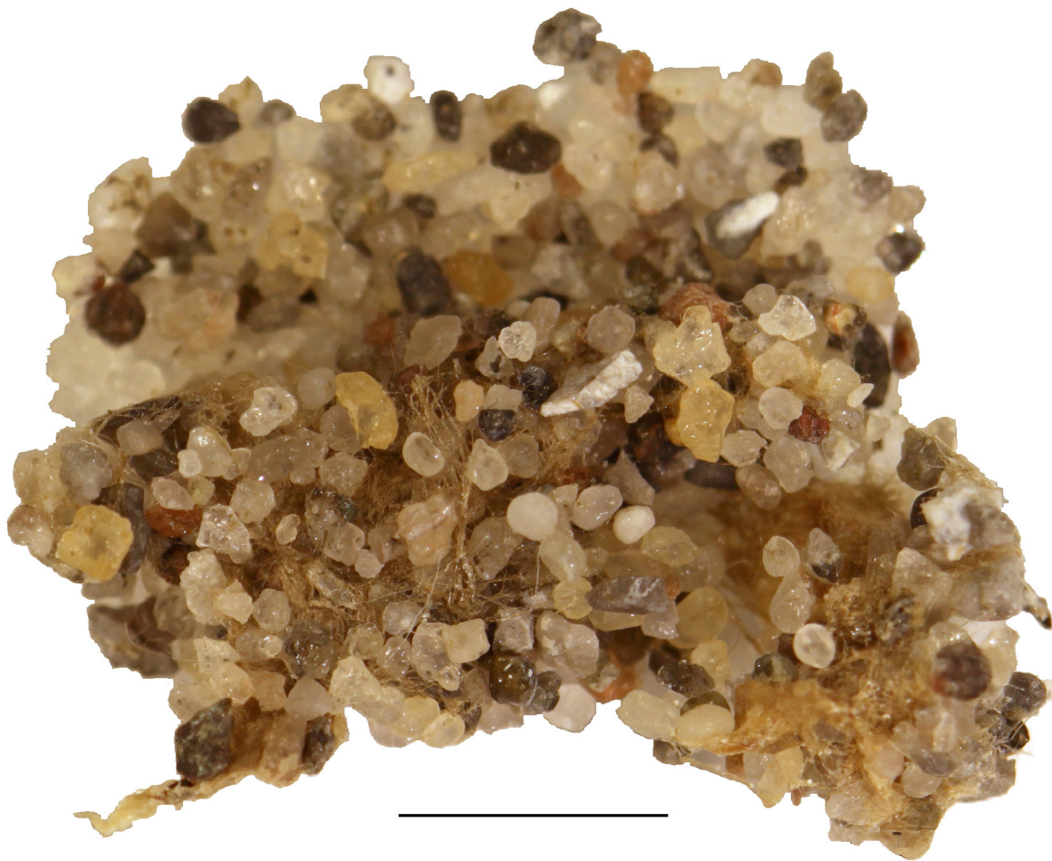
Fig. 2. Modiolus cimbricus sp. nov. A 17.5 mm long specimen in its ball of sand grains. This specimen has been cultured for five years. Scale bar = 5 mm.

A plausible hypothesis is that Modiolus cimbricus sp. nov. has evolved into a separate species after the Weichselian glaciation. It closely resembles M. adriaticus , from which it has evolved. The latter species belongs to the Lusitanian (Mediterranean) fauna that today has its northern border on the south and west coasts of the British Isles, including the Irish Sea (Ekman 1953; Hylleberg & Riis-Vestergaard 1984) (Fig. 3). This fauna is characterized by its corresponding Mediterranean-influenced water masses from the south. Today, a branch of the Gulf Stream presses towards the northwestern parts of the British Isles and the North Sea. It fills the latter with its water and results in a very stable current pattern because it is determined by sufficient water depth that allows for three amphidromic points in the North Sea (Dietrich 1963; Jelgersma 1979; Lund-Hansen et al. 1994; see also below). Consequently, the edge