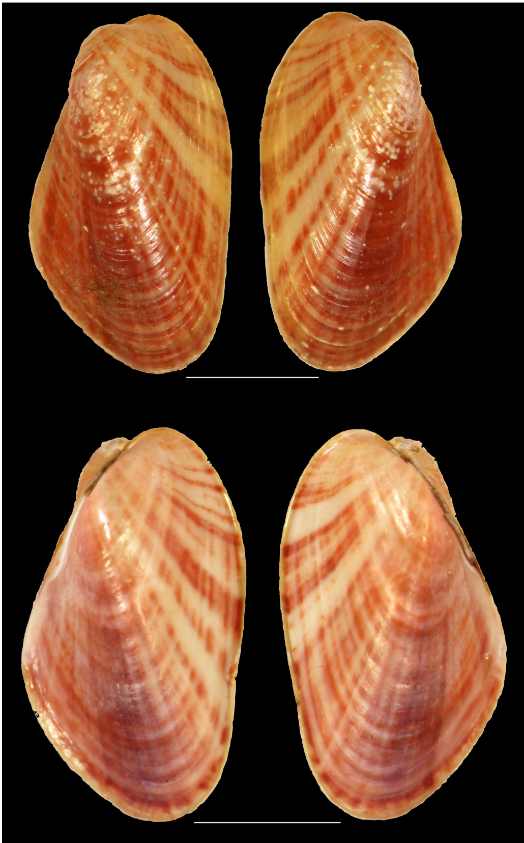
Fig. 1. Modiolus cimbricus sp. nov., holotype (shell length 13.3 mm). The upper part of the figure shows the external shell side and the lower part shows the inner side of the valves. Scale bars = 5 mm.