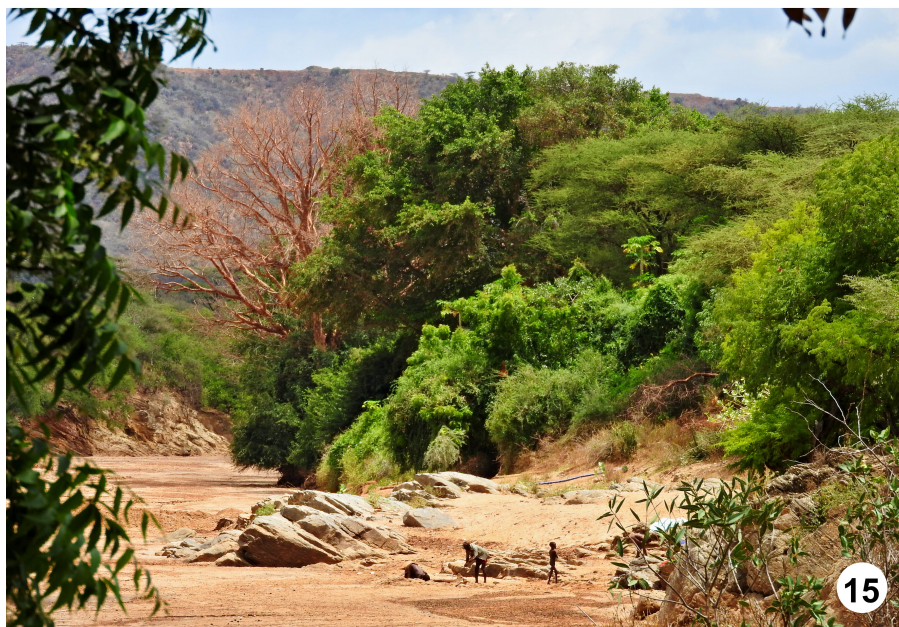
Figs 14–15. Afroarabiella species (type localities). 14. A. sulaki sp. nov., type locality. 15. A. strohlei sp. nov., type locality.