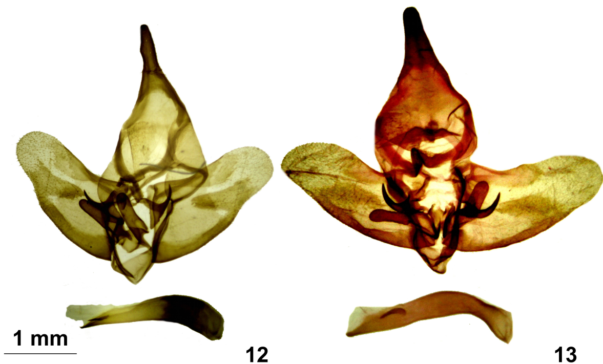
Figs 12–13. Afroarabiella species (male genitalia). 12. A. sulaki sp. nov., male genitalia. 13. A. strohlei sp. nov., male genitalia.