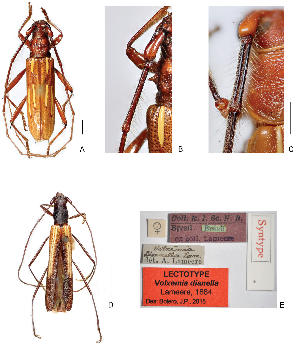
Fig. 3. A–B. Quiacaua vespertina (Monné & Martins, 1973) comb. nov., ♂. A. Dorsal view. B. Detail of antennomere III. — C. Eburodacrys longilineata White, 1853, detail of antennomere III. — D–E. Volxemia dianella Lameere, 1884, lectotype. D. ♀, dorsal view. E. Lectotype labels. Scale bars = 2 mm.

behind anterior eburneous callosities, in front and behind central eburneous callosities and at apex of elytra with dark areas. Brazil (Bahia, Minas Gerais, Espírito Santo, Rio de Janeiro) ..... Q. vespertina (Monné & Martins, 1973) comb. nov.