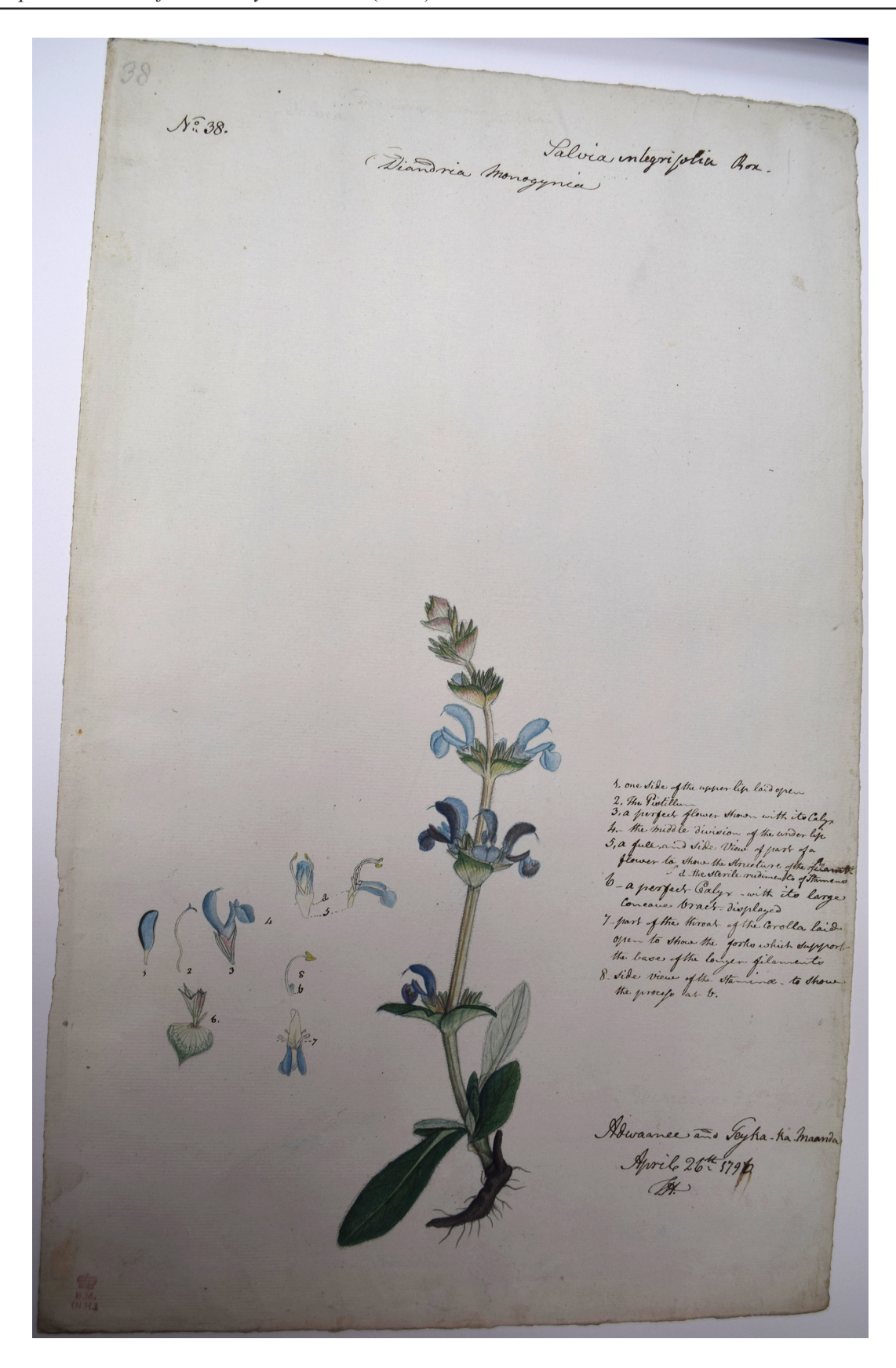
Fig. 2. Lectotype of Salvia integrifolia Roxb. ex Hardw., Hardwicke Drawing no. 38 from the collection of the Botany Library, Natural History Museum.