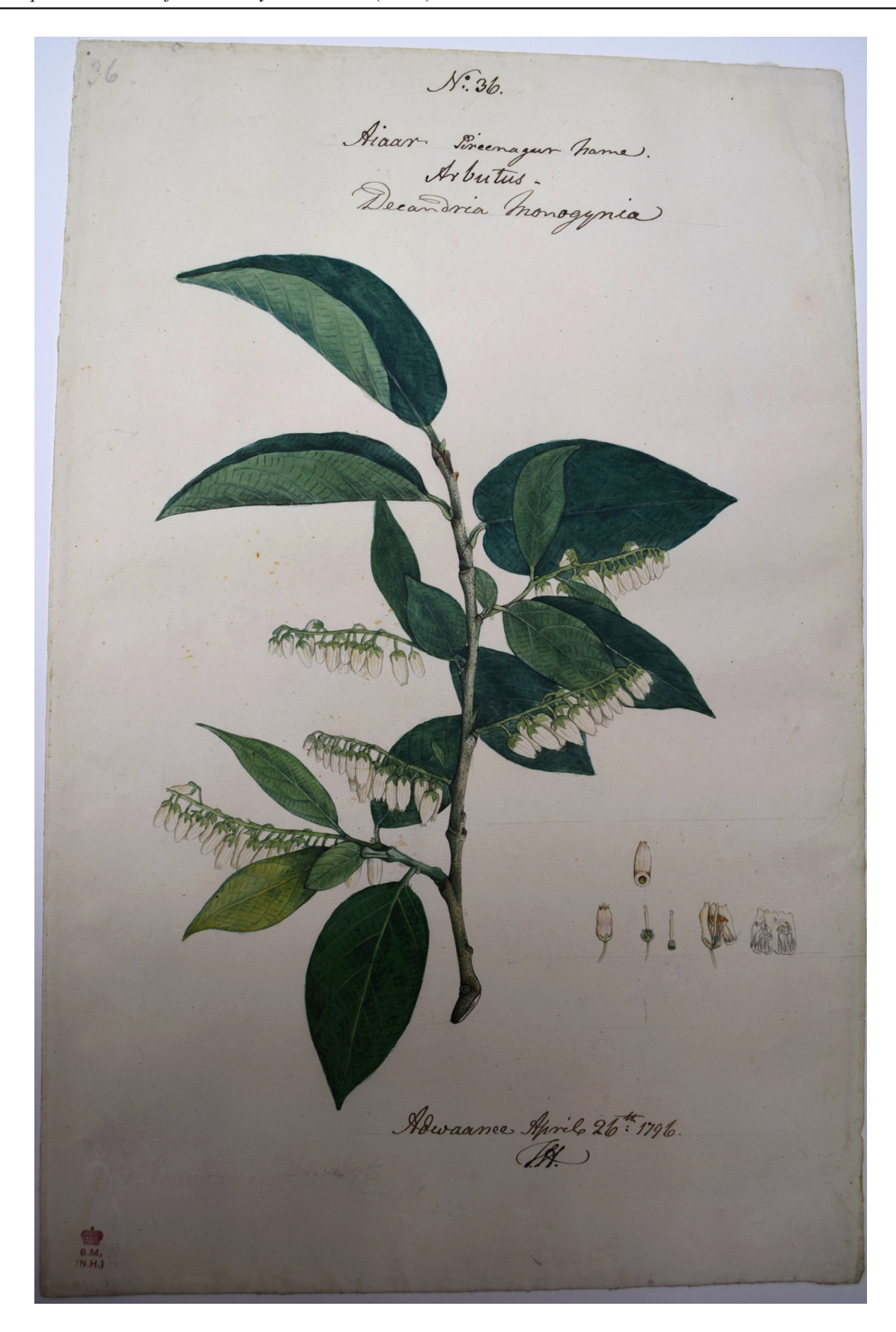
Fig. 8. Lectotype of Arbutus herpetica Coleb. ex Roxb., Hardwicke Drawing no. 36 from the collection of the Botany Library, Natural History Museum.