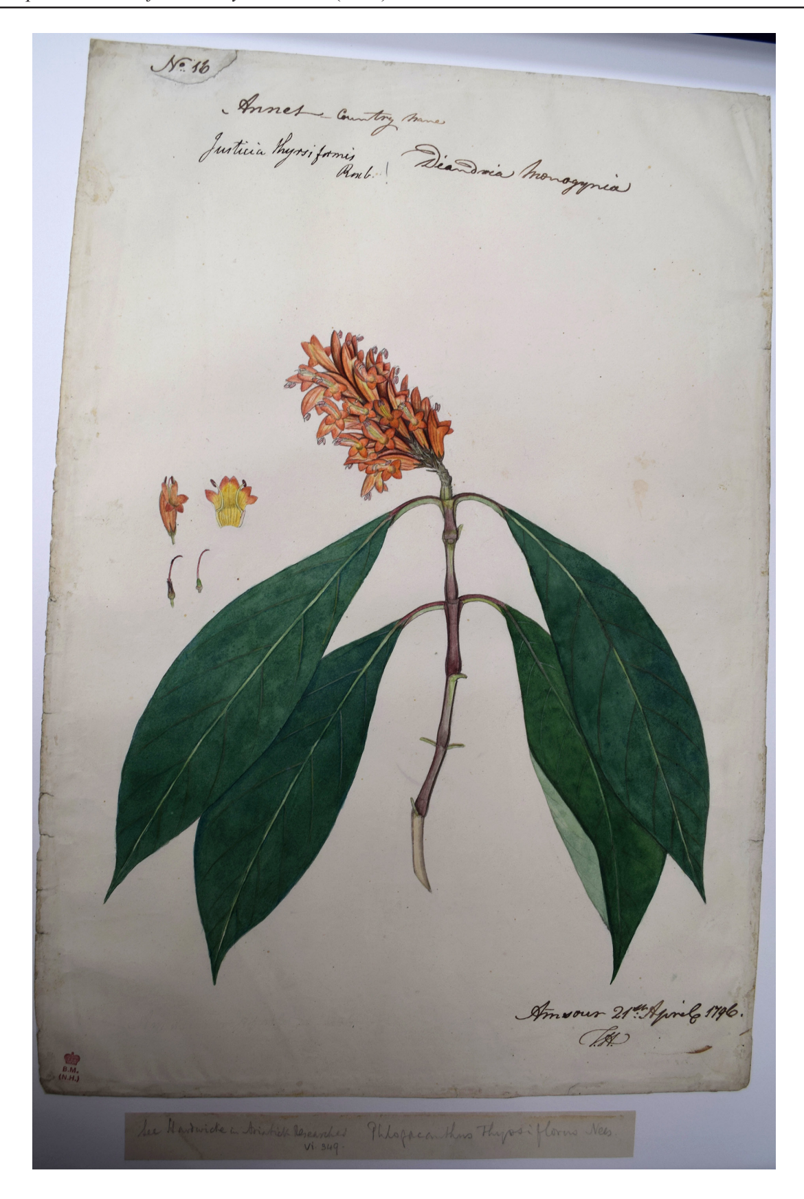
Fig. 1. Lectotype of Justicia thyrsiformis Roxb. ex Hardw., Hardwicke Drawing no. 16 from the collection of the Botany Library, Natural History Museum.