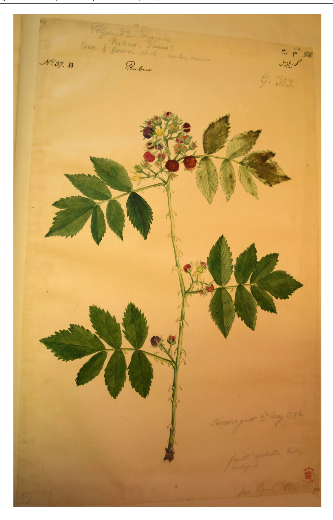
Fig. 9. Lectotype of Rubus rosiflorus Roxb., Hardwicke, Plants of India Vol. X (Add MS 11019): drawing no. 58. Reproduced with permission of the British Library Board.