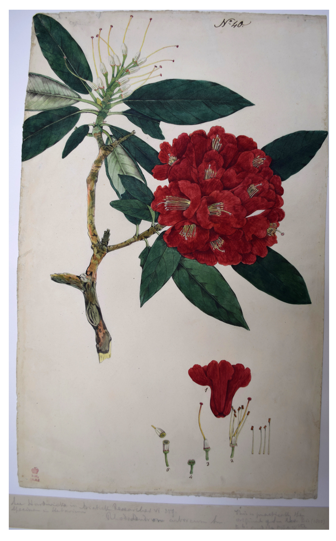
Fig. 6. Lectotype of Rhododendron arboreum Sm., Hardwicke Drawing no. 40 from the collection of the Botany Library, Natural History Museum.