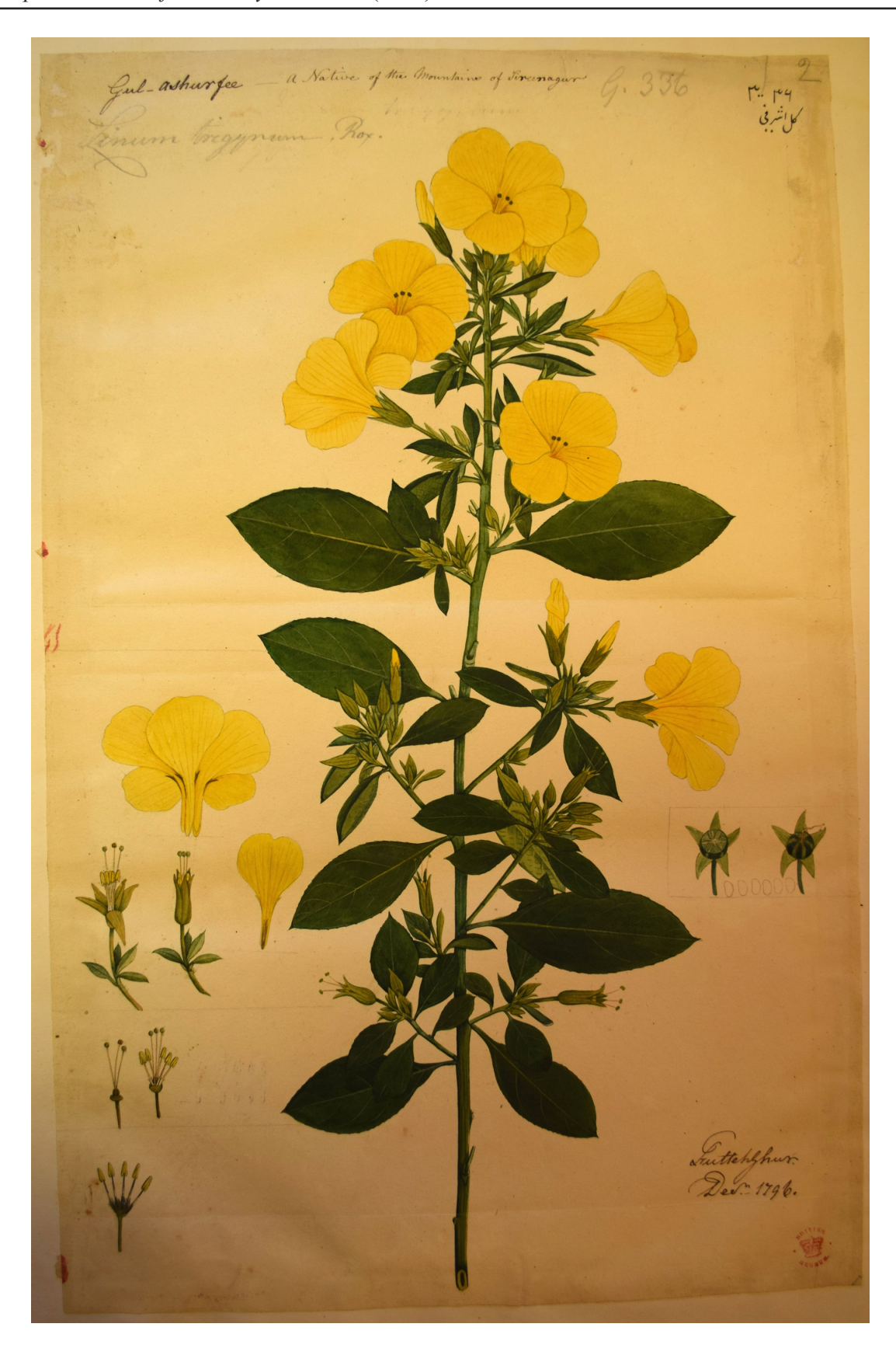
Fig. 4. Lectotype of Linum trigynum Roxb. ex Hardw., Hardwicke, Plants of India Vol. XVI (Add MS 11025): drawing no. 2. Reproduced with permission of the British Library Board.