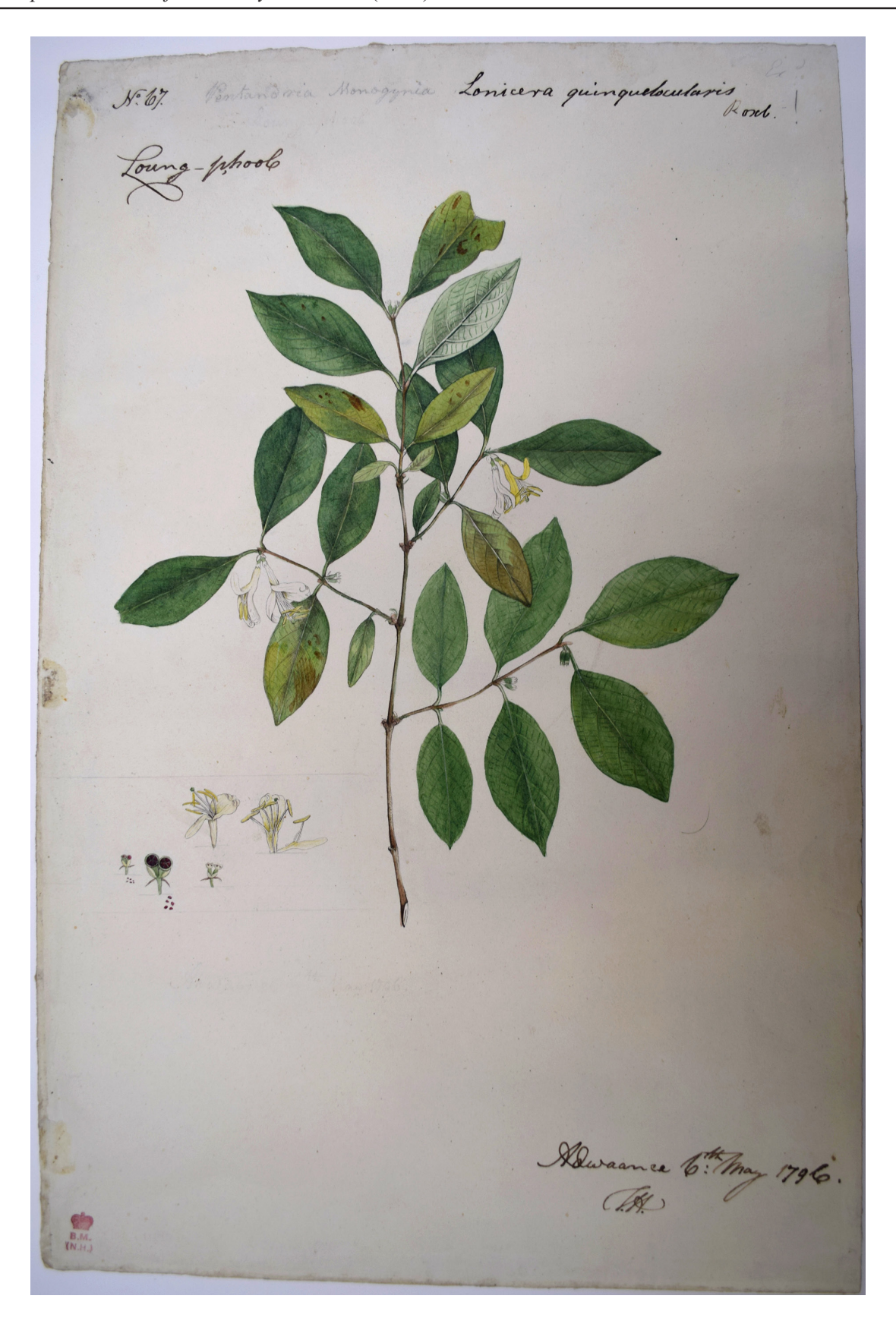
Fig. 3. Lectotype of Lonicera quiquelocularis Hardw., Hardwicke Drawing no. 67 from the collection of the Botany Library, Natural History Museum.