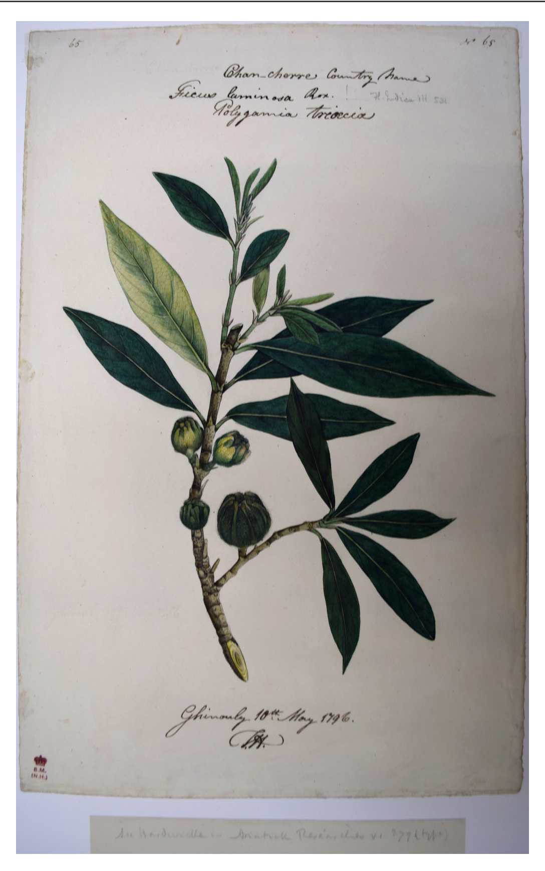
Fig. 5. Lectotype of Ficus laminosa Hardw., Hardwicke Drawing no. 65 from the collection of the Botany Library, Natural History Museum.