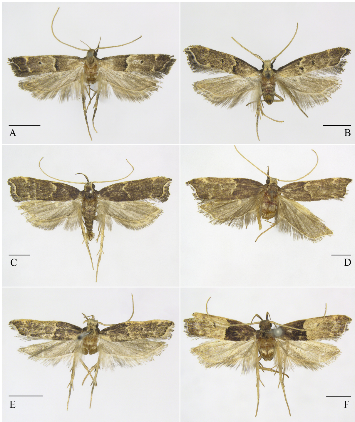
Fig. 1. Adults of Antiochtha spp. (dorsal view). A. A. erromera sp. nov., holotype (NKU). B. A. hainanensis sp. nov., paratype (NKU). C. A. jianfengensis Zhu & Li, 2009, from Hainan, China. D. A. jianfengensis , holotype of A. rotunda syn. nov. from Guizhou, China. E. A. miniscula sp. nov., holotype. F. A. semialis Park, 2002. Scale bars = 2.0 mm.

has an elongate median process on the posterior margin approximately as long as the uncus, and the female genitalia has a banded lamella antevaginalis.