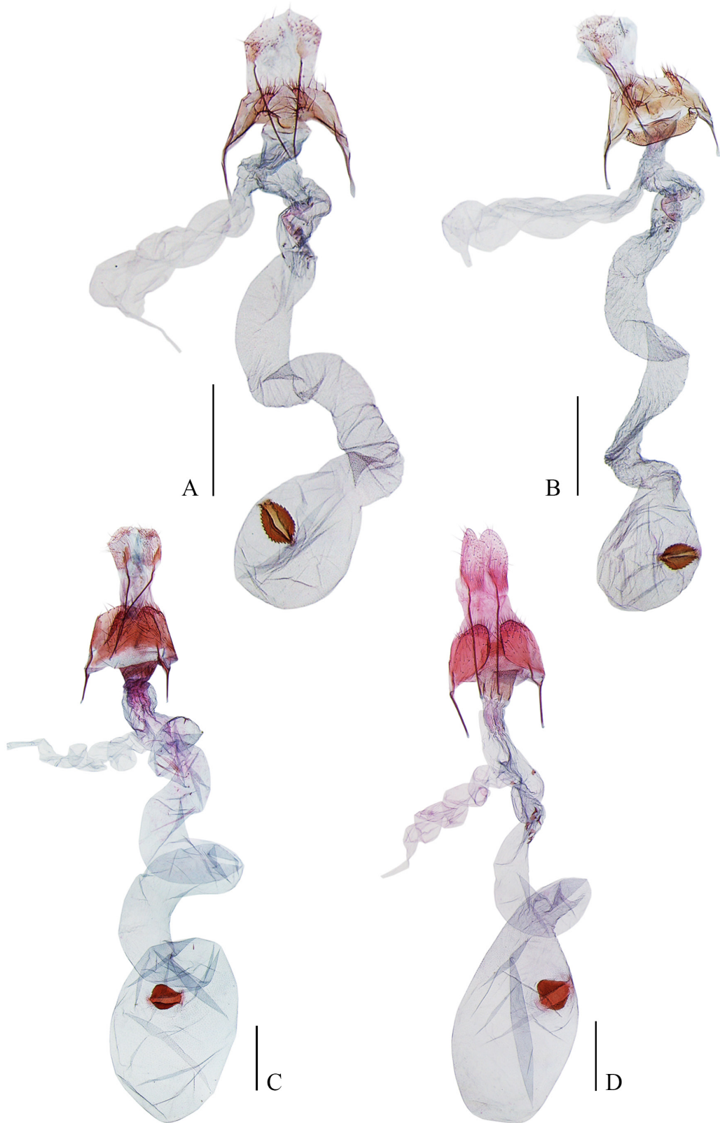
Fig. 4. Female genitalia of Antiochtha spp. A. A. erromera sp. nov., paratype, slide No. YS20065. B. A. hainanensis sp. nov., paratype, slide No. YS20228. C. A. jianfengensis , slide No. YS20074. D. A. semialis Park, 2002, slide No. YS20275. Scale bars = 0.5 mm