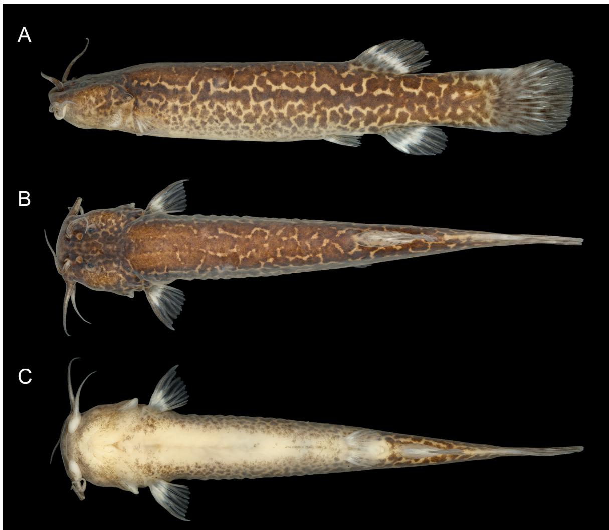
Fig. 1. Cambeva alphabelardense sp. nov., holotype (UFRJ 6990), 43.4 mm SL. A. Left lateral view. B. Dorsal view. C. Ventral view.

GENERAL MORPHOLOGY. Morphometric data appear in Table 1. Body relatively slender, subcylindrical and slightly depressed anteriorly, compressed posteriorly. Greatest body depth in area just anterior to pelvic-fin base. Dorsal and ventral profile of head and trunk slightly convex, approximately straight on caudal peduncle. Skin papillae minute. Anus and urogenital papilla in vertical through anterior portion of dorsal-fin base. Head sub-rectangular in dorsal view, almost rectangular. Anterior profile of snout slightly convex in dorsal view. Eye small, dorsally positioned in head, in its anterior half. Posterior nostril located approximately mid-way between anterior nostril and orbital rim. Tip of maxillary and rictal barbels posteriorly reaching interopercular patch of odontodes; tip of nasal barbel usually posteriorly reaching area just anterior to opercular patch of odontodes, sometimes shorter, reaching midway between orbit and opercular patch of odontodes. Mouth subterminal. Jaw teeth 20–23 on premaxilla, 24 or 25 on dentary, pointed and slightly curved, arranged in two irregular rows. Branchial