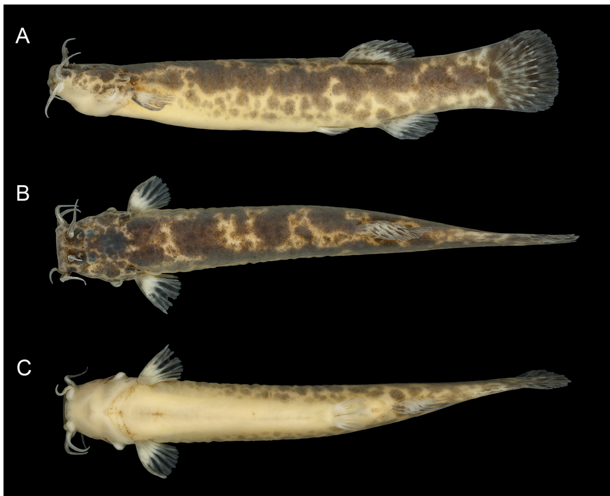
Fig. 5. Cambeva betabelardense sp. nov., holotype (UFRJ 6995), 42.7 mm SL. A. Left lateral view. B. Dorsal view. C. Ventral view.