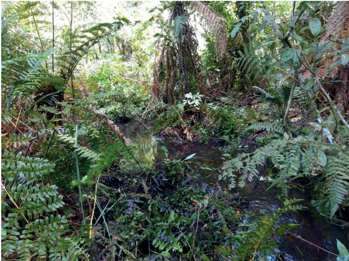
Fig. 4. Type locality of Cambeva alphabelardense sp. nov.

Cambeva alphabelardense sp. nov. is known only from the type locality area in the middle Rio Chapecó drainage, Rio Uruguai basin, southern Brazil (Fig. 3). The type locality is situated in the headwaters of a narrow stream, altitude about 800 m a.s.l., with clearwater, clay bottom and dense marginal vegetation mainly composed of ferns (Fig. 4). This short area, about 600 m long, corresponds to a small residual fragment of the original vegetation consisting of a mixed rainforest. This area is now surrounded by a