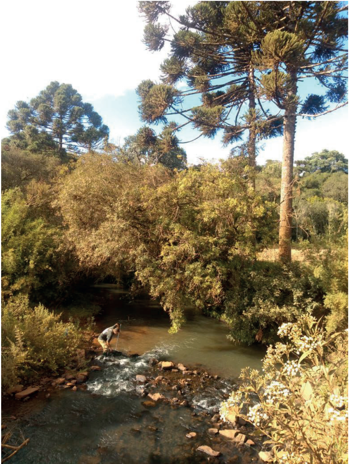
Fig. 6. Type locality of Cambeva betabelardense sp. nov.