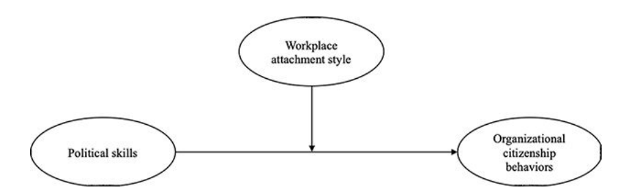
Figure 1 Theoretical Model