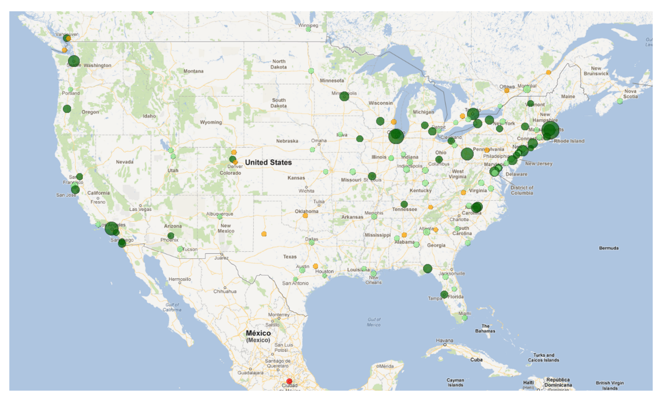
Figure 2. Cities in the USA with highly cited articles in psychology during 2007 (only cities are visualized with a total article output in 2007 of at least 50)<sup>7</sup>

in the USA is supported further by the large number of light green circles, only a very few orange-red circles, and no red circles in Figure 2.