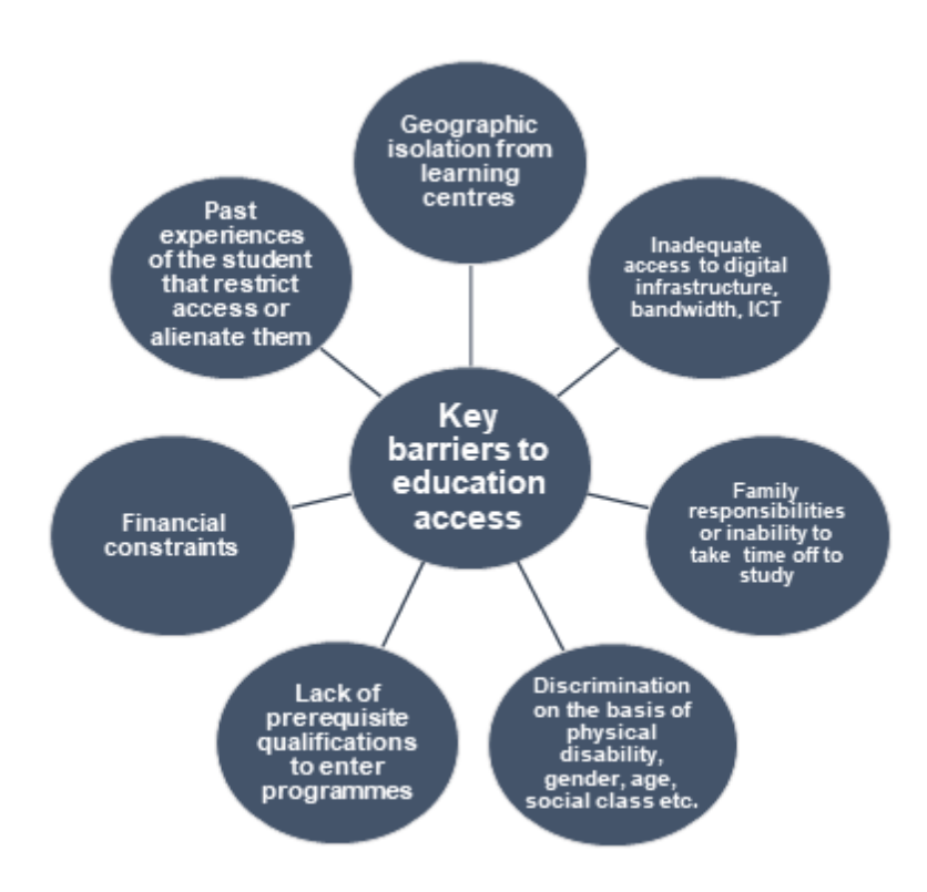
Figure 1: Barriers to access in South Africa's higher education sector

Specific barriers that Post School Education and Training in South Africa seeks to address are summarised in Figure 1.