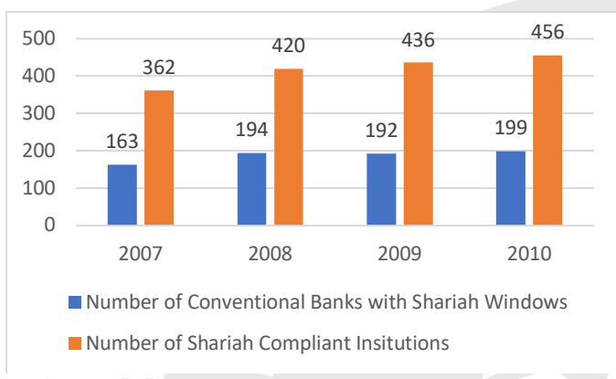
Figure 1: Institutions Registered for Shariah-Compliant Products