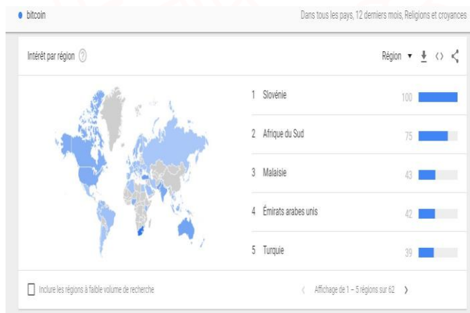
Figure 2. Geographical Search query

Figure 1 represents the behaviour of the search query of the word “Bitcoin” with religion and belief’s connotation from the period between 14/04/2017 and 14/04/2018. In figure 1, we can observe that the frequency of the term « Bitcoin » is very high in the period between 17/11/2017 and 23/11/2017. This period is marked by the remarkable evolution of the “Bitcoin”.