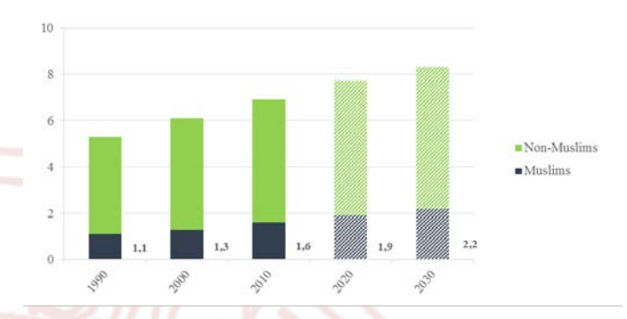
Figure 2 – Muslim Population Projections (Pew Research Center's Forum on Religion & Public Life, 2011)

than in previous years. Nonetheless, the growth rate will still far surpass that of the non-Muslim population.