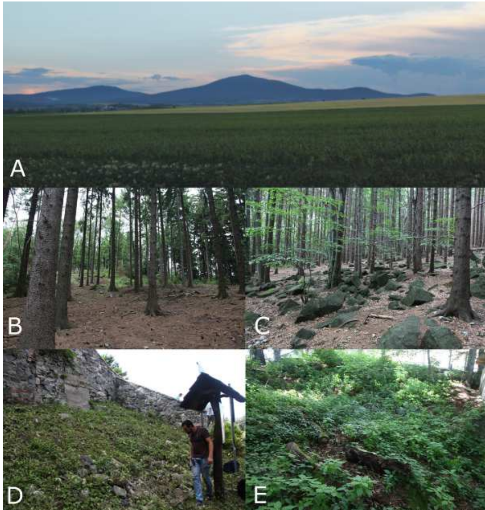
Figure 1. (A) Ślęża Massif, (B) spruce forests and (C) oak forests devoid of undergrowth growing on the slopes of Mt, (D) the site of the Roman snail at the top of the Ślęża Mountain, church of the Visitation of the Blessed Virgin Mary, (E) the site of the Roman snail near the transmission tower.