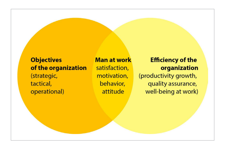
Figure 1 Relationship between the human factor and the organization's goal and operational efficiency (Kalkis, 2014, 30)s

In order for employees to be able to perform their duties qualitatively, it is necessary that the company's internal standards and processes are clearly defined. They help maintaining order and make daily work easier by reducing losses, which is important for efficiency gains. By the quality we mean a great product or service that meets or exceeds customer requirements (Besterfield & et al., 2021, 7).