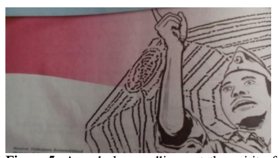
Figure 5. A male hero calling out the spirit of struggle.

The Figure above is one of the most famous international soccer players. He is one of the best soccer players in the world. He is holding the winning trophy on the field. The soccer game is an activity that shows the masculine side of men. A football game is a favorite game for boys. According to Rahmatullah (2014, p. 377), playing soccer is also known as a game for boys, although now there is some girl also play soccer.