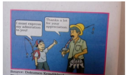
Figure 2. father and son were talking about fishing

The Figure above shows 2 men doing mountain climbing activities in the forest, and this activity is often done by men. This activity shows the masculine side of a man. It means that males prefer activities outside the house than inside the house.