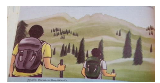
Figure 1. 2 men doing mountain climbing activities in the forest

The study found that gender visibility in the pictures is dominated by a male.it is 46 pictures. While gender visibility for females was 34 pictures. The study found that gender-specific noun in the pictures is dominated by a male it is 6 words and for a female is 5 words. The study found that there are some stereotyping pictures. It is 14 pictures. Some pictures show male, power, and masculinity and 6 pictures show female and femininity. Some pictures show the stereotyping. The following's picture that showed stereotype: