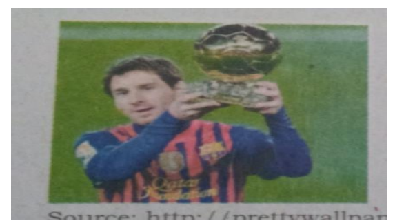
Figure 4. One of the most famous international soccer players

associated with the more hard and higher status job than females.