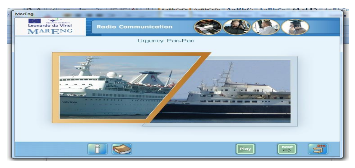
Figure 4. Urgency

The salient frame indicates who is in turn of the conversation, and defines that they are in conversation (look at the orange frames on figure 4). The findings of symbolic attributive meanings showed that the images tried to visualize conversation between two different parties. This fact is in line with the ideational meanings which showed that the relational processes have the highest percentage which defined the participants of the conversations (Heberle & Constanty, 2016). Hence, the images try to symbolize the main events happening in the verbal texts in order to make the audiences are able to infer what the verbal texts are going to discuss. The images which are symbolic attributive give direct representation to the viewers about what the images try to tell the viewers about. When the viewers 1ook at the images radio communication texts (all images), the viewers directly know that the images are about the conversation between the participants in the picture (Yang & Zhang, 2014)