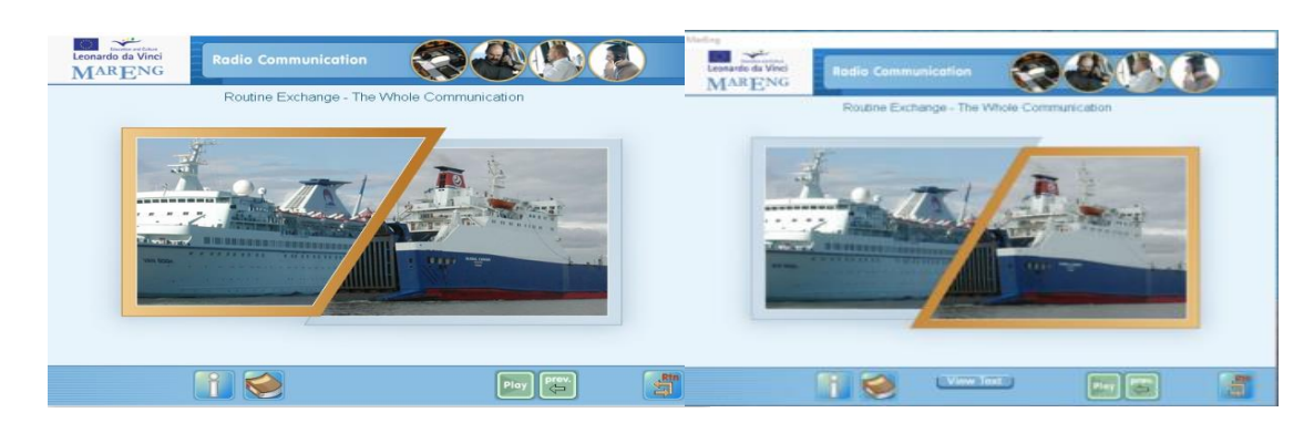
Figure 2. Routine Exchange

representational processes specified as symbolic attributive process and also narrative representational processes.