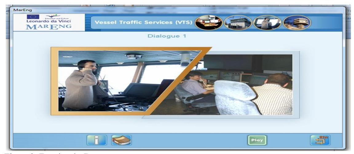
Figure 3. Entering the Port

communication between the two carriers (two vessels side by side) by placing two different vessels in a different place to depict that the vessels are communicating with each other.