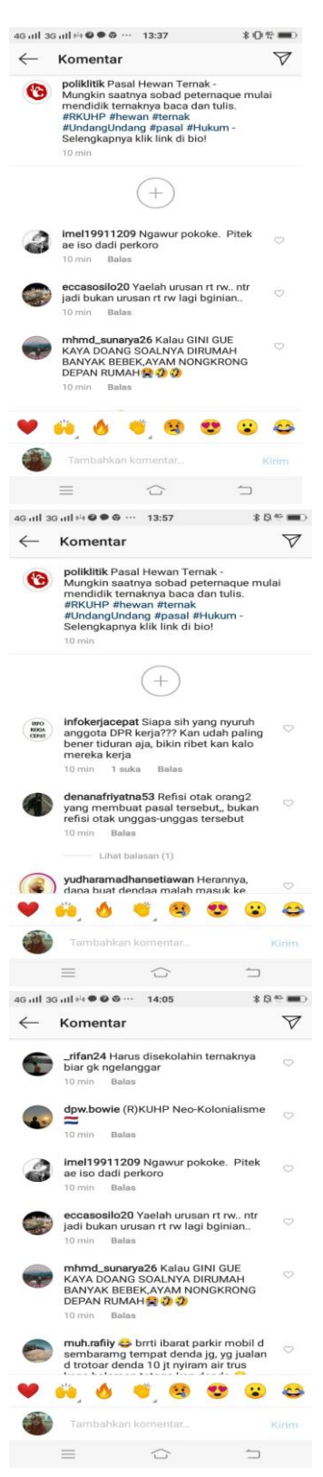
Figure 4. Sociocultural discourse

Figure 3 was released on the 24th of September 2019, attracting 11,540 likes and 227 comments. Concluding the comments, netizens mostly use LOL (laugh at loud) or its emoticon ( ) to laugh at the interpretation of the draft of the Book Criminal Law on livestock. This draft is considered funny and one of the foolest drafts. The netizens ask farmers to send their animals to school to satire the draft composer. Sharpen their opinions; they would catch livestock that entered the yard and get 10 million in fines. They also think they will get rich quickly because many animals enter their yard if it happens every day.