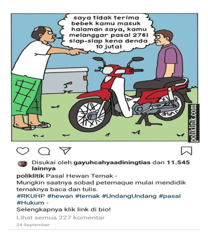
Figure 3. livestock inspires Poliklitik.com cartoonist to create