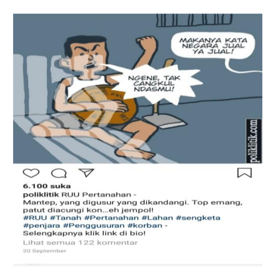
Figure 5. The Draft of the Book Criminal Law on Land