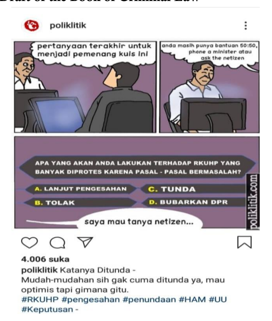
Figure 2 . The cancellation of the Draft the Book Criminal Law on Human Rights ratification