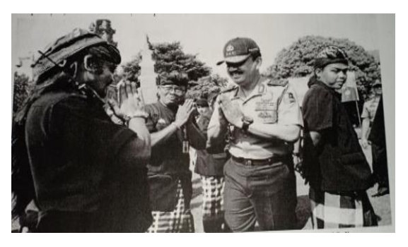
Figure 2. National Police deputy chief Comr. Gen. Budi Gunawan (center) meets with traditional Balinese security

Rhetoric element is used to know how the emphasis is put in the news, which in this case can be seen from the graphics. Graphics are used to understand the emphasis or focus from the letters type (bold, italic, underline, bigger font), the picture, the table, and the diagram (Eriyanto, 2001). From this news article, the writer found the picture as present below: