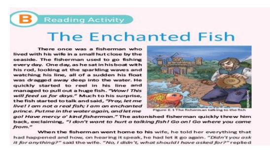
Figure 1. Example of Product Dimension

Product dimension found in the textbook is exemplified in the following datum.