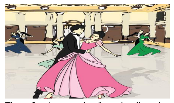
Figure 2. An example of practice dimension found in the textbook is presented in the following datum.

Silvia (2015) states that practice dimension refers to some rituals, daily activities, cultural events in society such as holiday celebrations, ceremonies, past traditions and alike. Meanwhile, Suadi (2016) states that practice refers to customs, traditions, rituals, and daily life. An example of practice dimension found in the textbook is presented in the following datum.