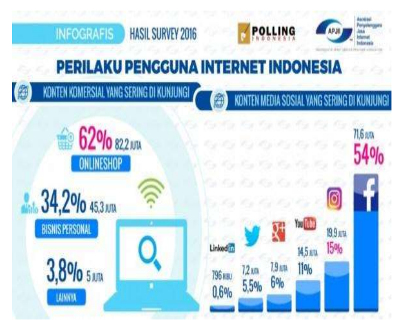
Source: APJII (Indonesian Internet Service Provider Association)<sup>21</sup>

The number of Internet users in Indonesia in 2016 was 132.7 million users, or approximately 51.5% of the total population of Indonesia amounted to 256.2 million. Most Internet users are on the island of Java with a total user 86.33935 million users, or about 65% of the total use of the Internet. When compared using Internet Indonesia in 2014 amounted to 88.1 million users, then there is an increase of 44.6 million over two