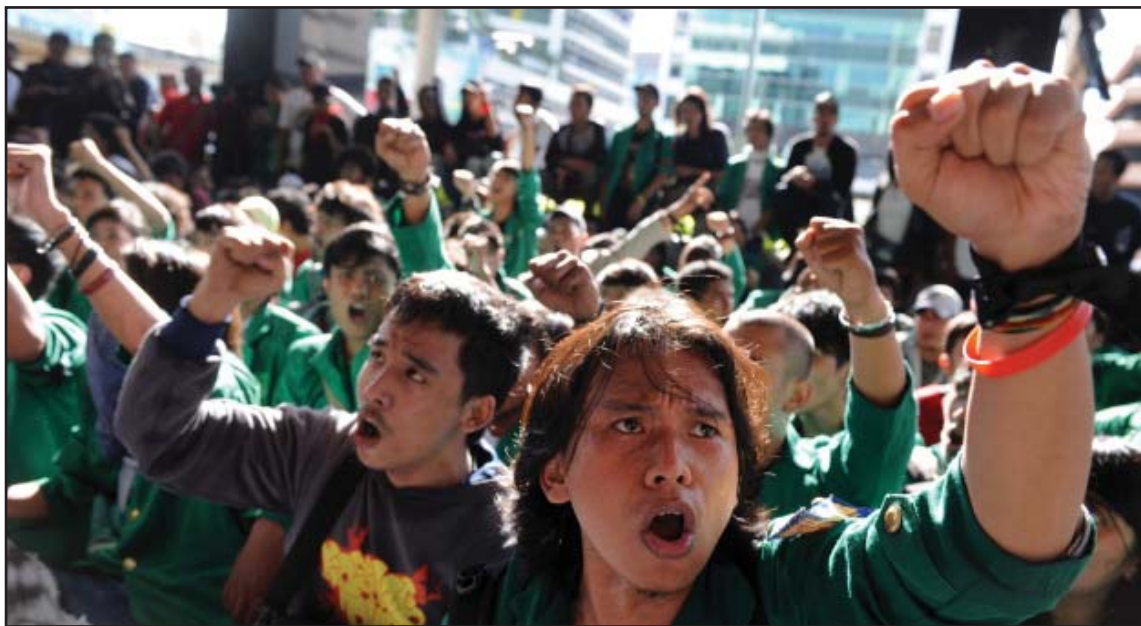
Democracy in Indonesia: Between Hope and Reality

The break of Reform waves in 1990's has brought a new hope of demoracy development and of realizing a civil society in Indonesia, though it left many unresolved social phatologies in the transition periods. Building a strong foundation of democracy and civil society, particularly in the transition times, should not only be fought; it shall be nurtured, grown through well-planned efforts targetted to all layers of the whole society.