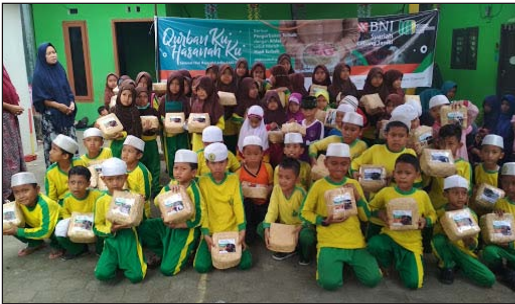
Islamic Early Childhood Education in Jambi, Indonesia

Empathy must continue to be developed and maintained in schools, so that children will always have growing empathy. Habits, such as giving to infants and visiting orphanages, can improve children's empathy abilities. One of the lessons that can increase children's empathy is through storytelling using hand puppets.