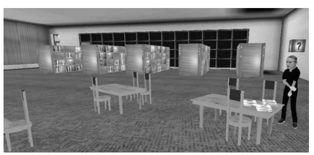
Fig. 3. Simulated middle school library.