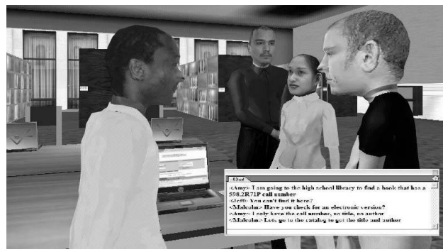
Fig. 2. 3D simulation.