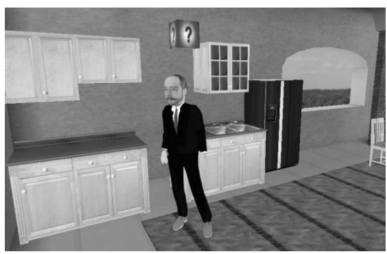
Fig. 5. Simulated informal information environment.