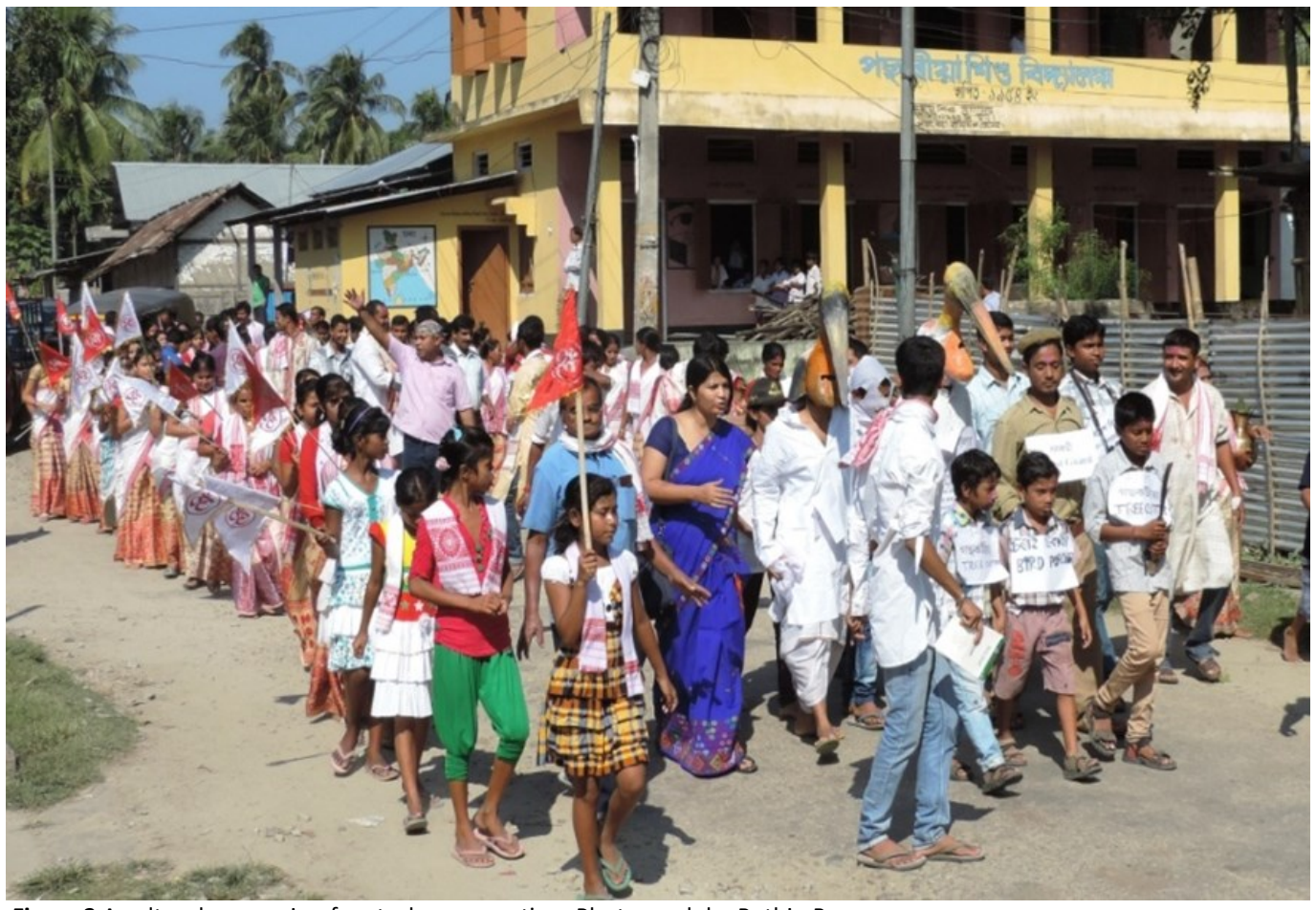
Figure 3 A cultural procession for stork conservation.

in conservation program activities and even voluntarily published a roadside sign with conservation messages about the storks in the area. The involvement of police made a real difference and poachers did not have the courage to disturb or kill storks in the colony.