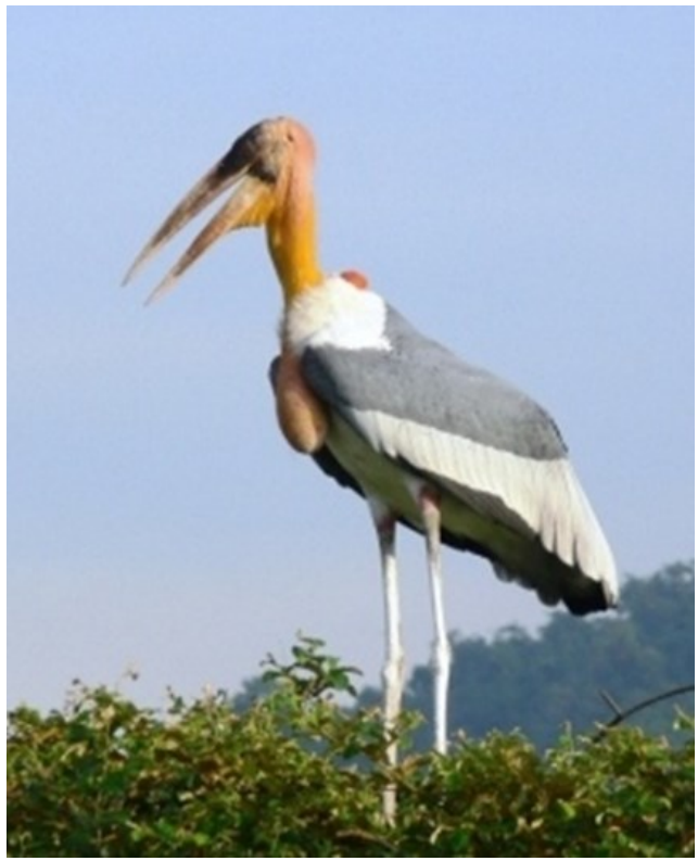
Figure 1 Greater Adjutant Stork in Assam.

Knowledge of breeding sites of Greater Adjutants in India was limited to 75 sites found during a survey conducted in 1989 and 1990 in Assam (Saikia and Bhattacharjee 1990a, 1990b). The largest colony had 31 nests, with most of the nests in private forest areas in villages and suburban areas. Threats to the species were identified as the killing of storks, felling of nesting trees for wood or to remove storks due to dislike of the noise and smell of nests with young birds, lack of awareness of the species and its status as legally protected, and the loss of wetland foraging habitat (Saikia and Bhattacharjee 1990b).