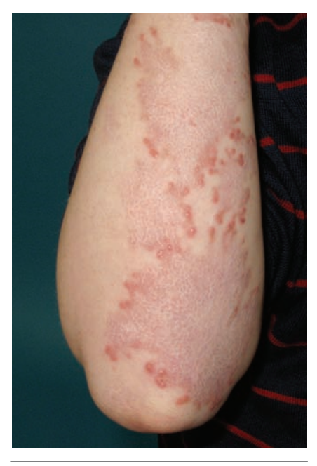
Figure 3. The treatment result after topical therapy with imiquimod 5% cream, once a day for 6 weeks followed by 3 times weekly in a period of approximately 5 months. The elements became less inflamed and infiltrated.

tous and hyperkeratotic papules appeared five years prior and progressed centrifugal to form a pattern of linear, annular and serpiginous lesions with central heeling and atrophy. Peripherally infiltrated reddish keratotic papules with central depression and overlying desquamation, was seen. The patient had been treated unsuccessfully with topical corticos-