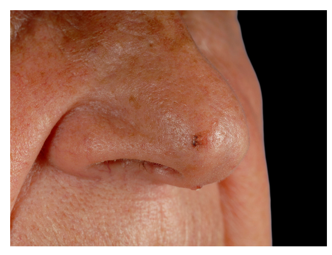
Figure 1. Clinical image.