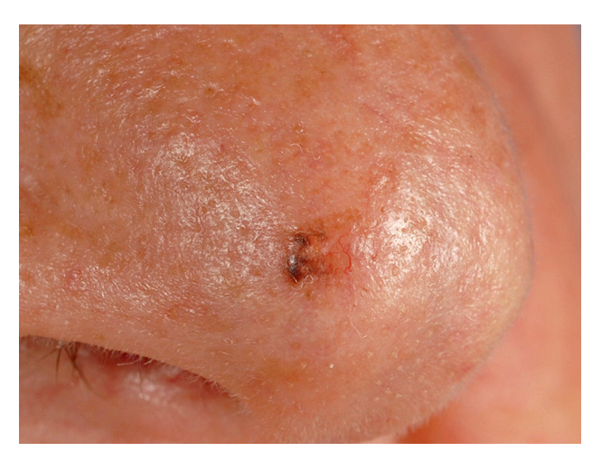
Figure 2. Clinical close-up.