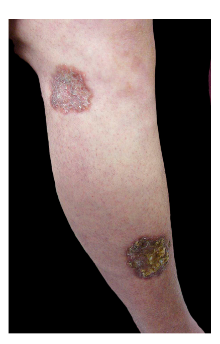
Figure 1. Two of the reddish-brown plaques on the leg. Note the difference in their clinical appearance.

Physical examination revealed annular waxy brown plaques with central atrophy and a lilac colored advancing edge located on the left posterior-lateral calf measuring 5 x 4 cm, left dorsal hand 5 x 3.5 cm, and left forearm 11 x 9 cm (Figure 1). Interestingly, a 5.5 x 4.5 cm plaque on the right anterior