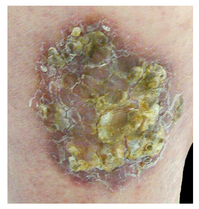
Figure 2. Hyperkeratotic scaling of the plaque on the right anterior shin.

ance of all lesions including the hyperkeratotic one, with no increase in size of the plaques.