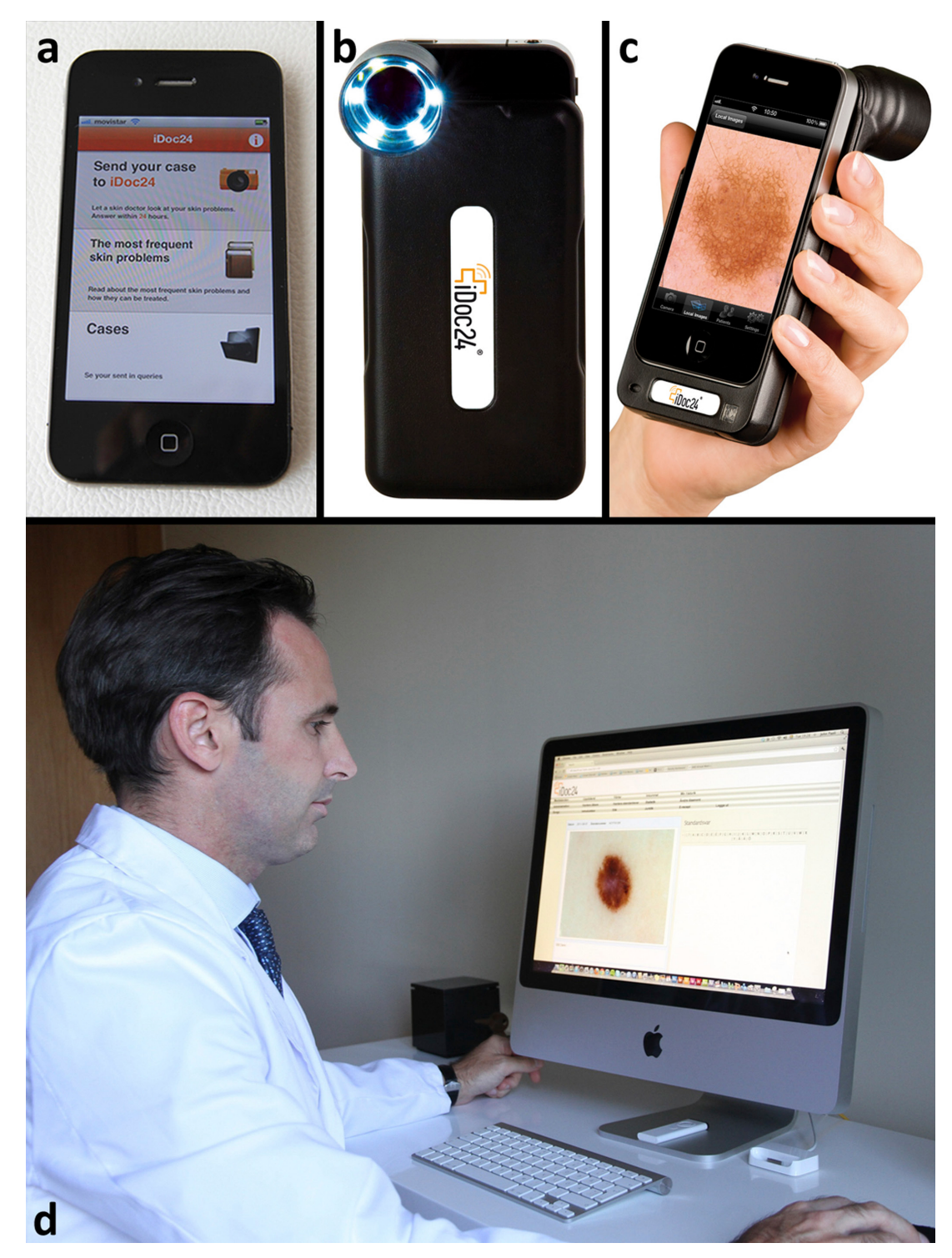
Figure 1. Technologic equipment used in the mobile teledermoscopy solution: (A) the smartphone (iPhone 4<sup>®</sup>) with the iDoc24<sup>®</sup> app showing on the display; (B) the dermoscope (Fotofinder Handyscope<sup>®</sup>) with its six light-emitting diodes lit; (C) the dermoscope attached to the smartphone displaying a dermoscopic image of a reticular nevus; and (D) a dermatologist viewing a case on the Internet platform (Tele-Dermis<sup>®</sup>).

to the two TDs for assessment. The participating TDs were two specialists in dermatology who also had several years of experience within the fields of skin cancer and dermoscopy. The email received by the TDs contained a direct link to the Tele-Dermis<sup>®</sup> platform. After logging in, the cases were assessed and triaged independently by both TDs on a computer screen (19-inch liquid crystal display monitor). They were asked to assess if the lesion was benign or malignant