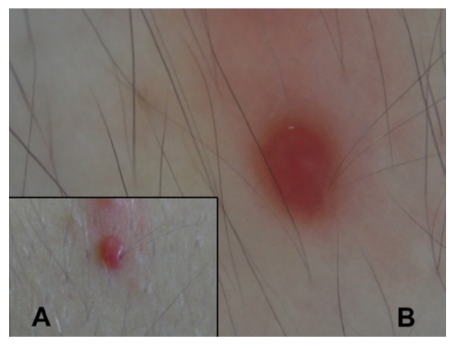
Figure 1. (A) Small red nodule on the abdomen; (B) Diffuse structureless red color, fine linear vessels and whitish striae at dermoscopy examination.